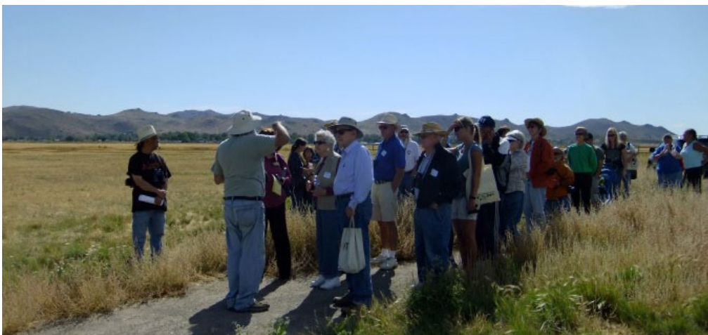
Neighbors participate in a guided bird walk during the "Swan Lake Saturday" outreach event.

Through promotion of the Bill of Rights, encourage Nevada's children to participate in outdoor recreational activities, engage in lifelong learning adventures, and become stewards of the environment.