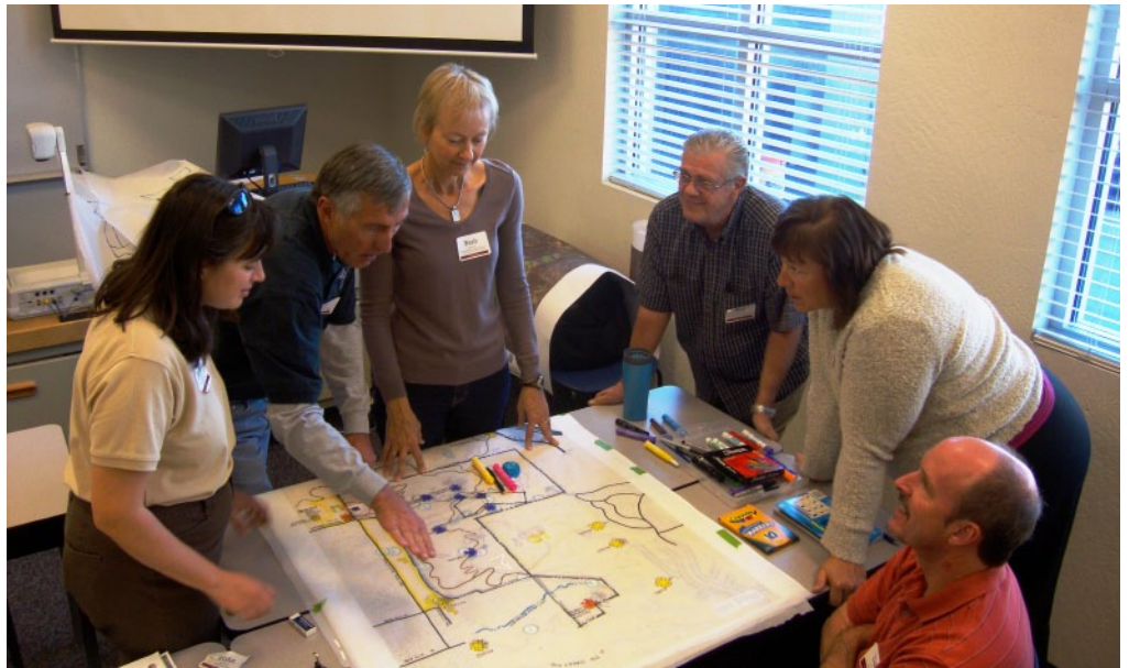
Red Hill Design team creates a conceptual plan that includes recreation and conservation.

Plan the 2012 Open Space and Trails Summit, where community and business leaders, non-profits, health professionals, and key agency staff will celebrate the Neon to Nature trails