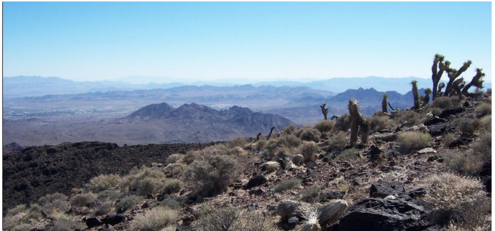
Gypsum Ridge provides spectacular and readily accessible views of the Las Vegas Valley.

The CVTA, in partnership with Douglas County and other partners, are working to implement a 100-mile loop trail and community trail connections. In order to connect existing and planned segments for a continuous