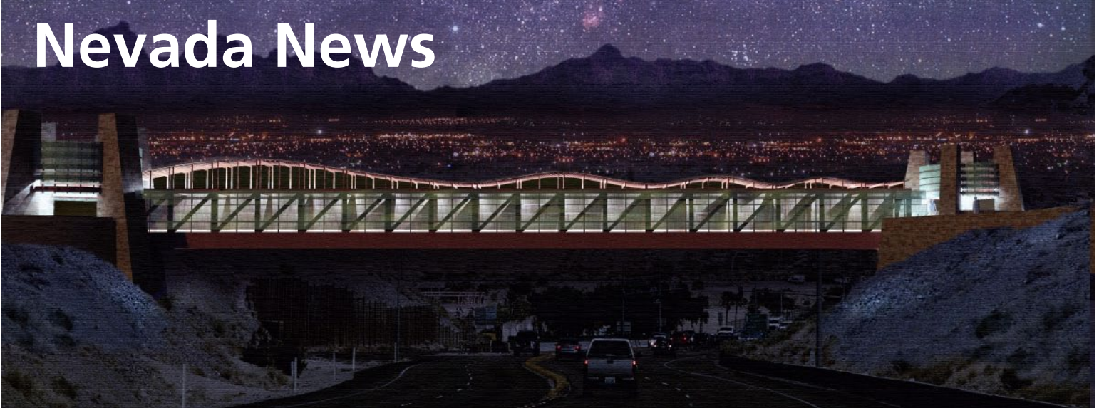
Pedestrian bridge will provide a safe crossing for the North Reach Trail