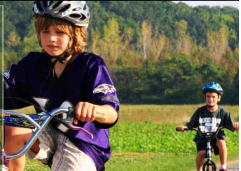
Boys ride along the future route of the North Point Heritage Greenway Trail in southern Baltimore County.