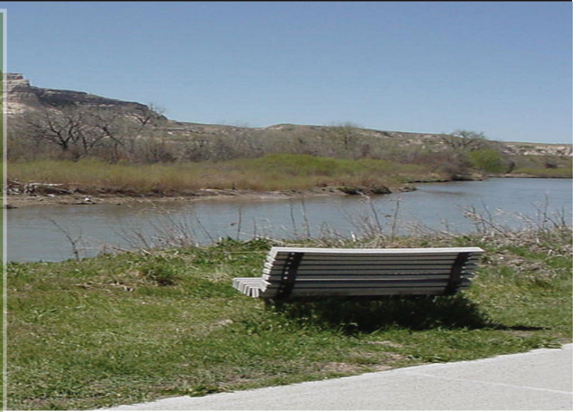
A relaxing view along the river.