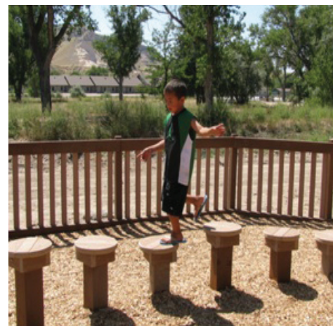
Children playing at new Trails of Fun Playground at Riverside Park, Scottsbluff