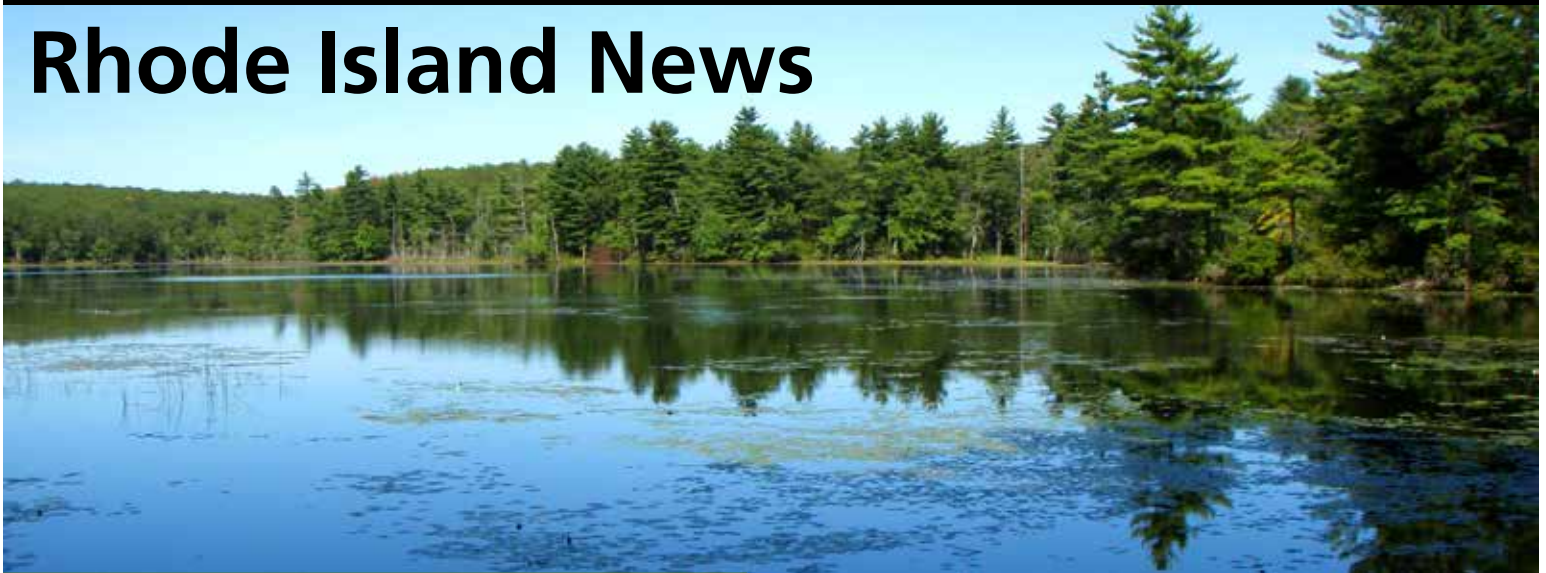
Tillinghast Pond Preserve in West Greenwich, Rhode Island.