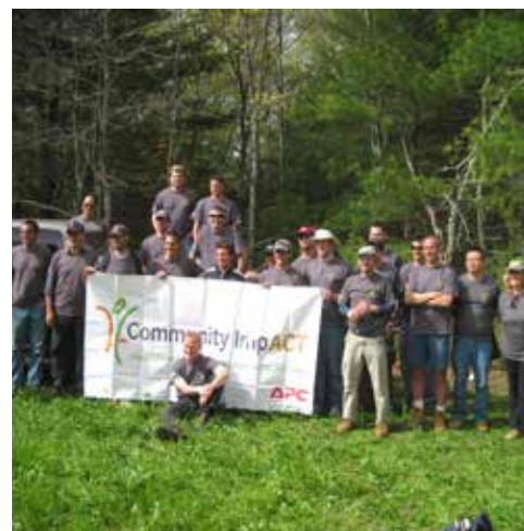
Proud volunteers from Schneider Electric, working on the Tillinghast Pond Management Area Trail.