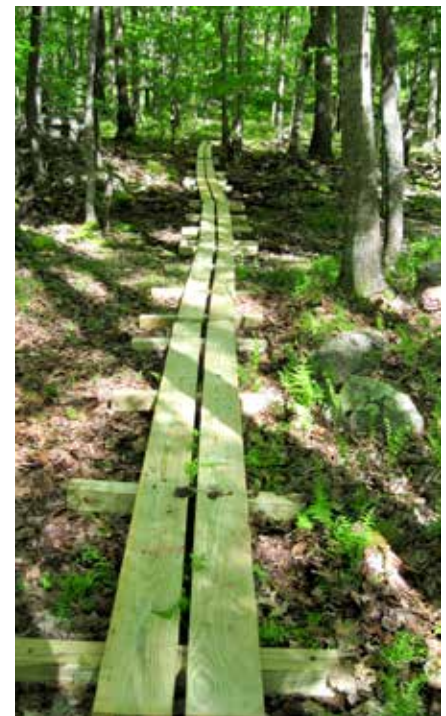
A bog bridge constructed by volunteers in Tillinghast Pond Preserve.

Working alongside TNC and AMC volunteers were the Coventry Boy Scouts, students from The Greene School (environmental charter high school), and corporate volunteers from Schneider Electric. A spur trail further connects both properties to the Pratt Conservation Area, protected by the West Greenwich Land Trust.