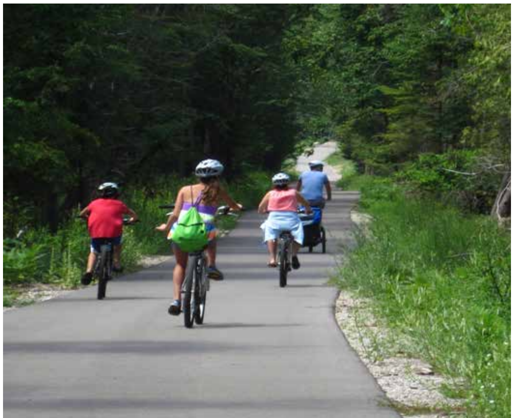
Visitors enjoy a ride on the Sleeping Bear Heritage Trail. Another 6 miles of the trail will be opening in 2014.

Work with the City of Cadillac, the Michigan Department of Natural Resources, and other partners to identify alternatives for extending the White Pine Trail into downtown Cadillac. Determine the best alternative, and develop a trail concept plan and a funding strategy.