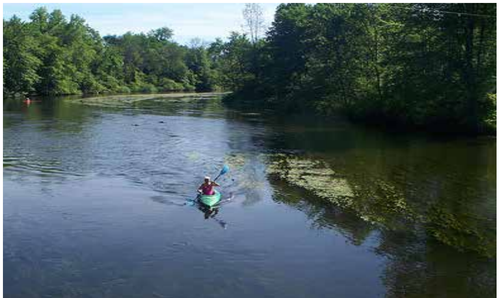
Flat River paddler.