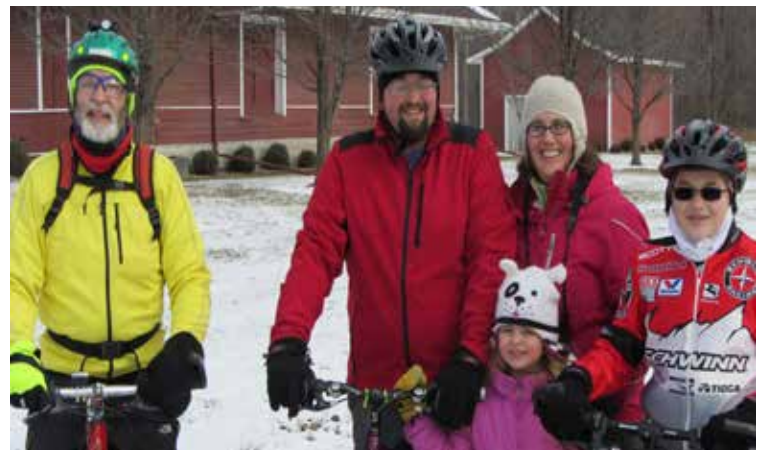
Flat River Trail winter trail riders.

Forty two miles of the Clinton-Ionia-Shiawasee Rail Trail (CIS) is under construction and will be opened in 2014. The CIS is part of a 125-mile, mid-Michigan, rail-trail network and the Fred Meijer River Valley Rail Trails. The NPS worked with the Michigan Department of Natural Resources, the Friends of the CIS, the Fred Meijer River Valley Rail Trail, the Michigan Department of Transportation, the Midwest Michigan Trails Authority, and local units of government on the master plan to create a pedal and paddle trail. The trail incorporates the adjacent Flat, Grand, and Maple Rivers and connects the communities of Owosso, Ovid, St. Johns, Pewamo, Muir, Ionia, Lowell, Belding, and Greenville. The “pedal and paddle” system provides tremendous recreational opportunities and a variety of experiences for public use and enjoyment.