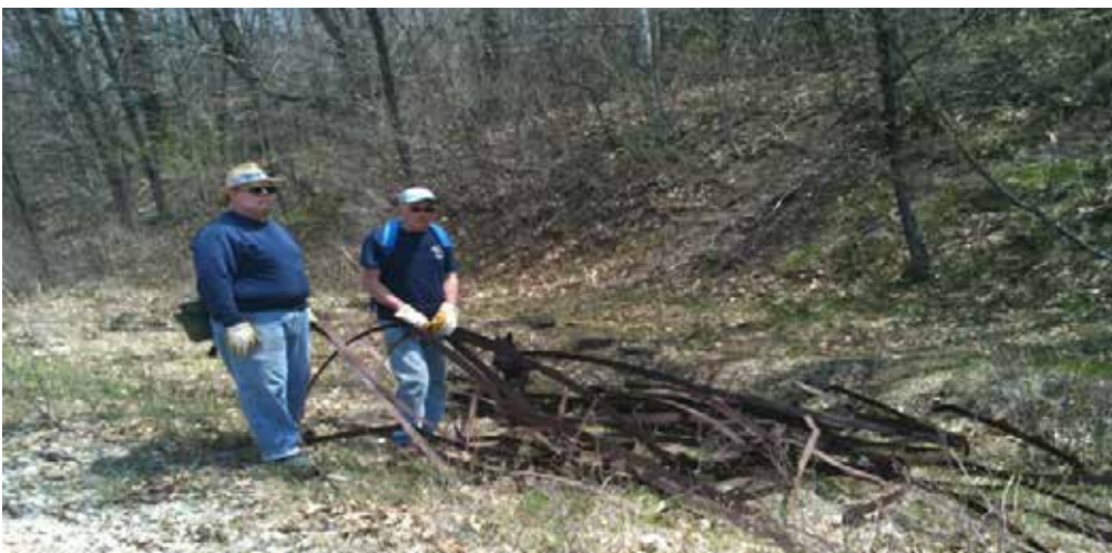
You've got to have "Friends!"

Help develop leadership and support, and facilitate the planning and development process for a 40-mile Copper Heritage Trail connecting historic copper mining towns in Houghton and Keweenaw Counties.