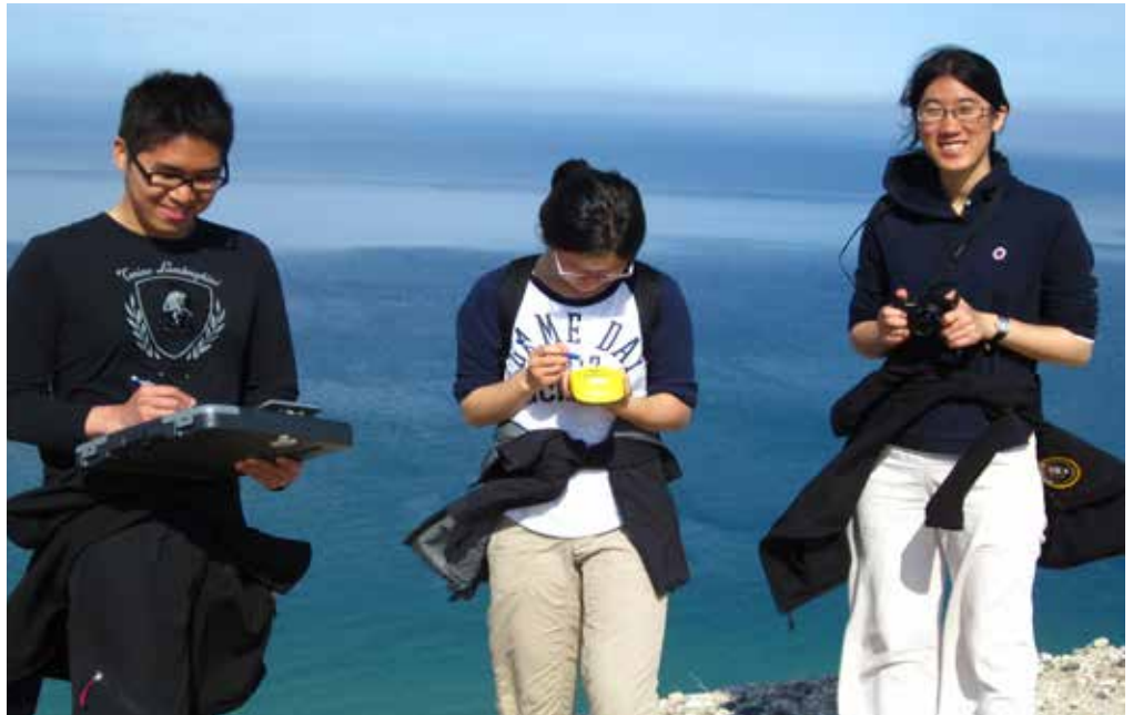
University of Michigan Graduate Students working with Friends of Sleeping Bear and the NPS on the route for the Bay to Bay Hiking and Paddling Trail.

Convene a project steering committee, stakeholder advisory group, and facilitate the planning process to determine the Bay to Bay Trail route, campground and launch locations, signage and funding strategy.