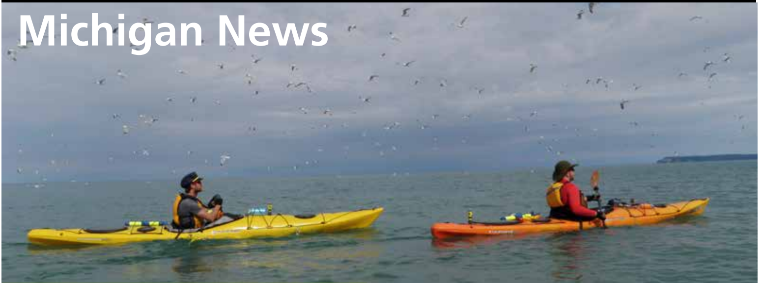
Bay to Bay Water Trail Epic Paddle.