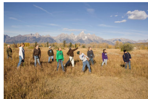
Youth enjoying the outdoors.

For further information about RTCA and the work we are doing around the country with nearly 300 communities, please visit our national web site at http://www.nps.gov/rtca .