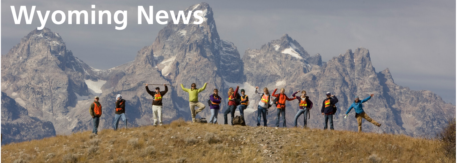
Wyoming youth at the Second Wyoming Youth Congress.