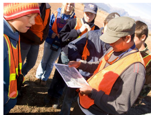
Young navigators.

"I go to nature to be soothed and healed, and to have my senses put in order."