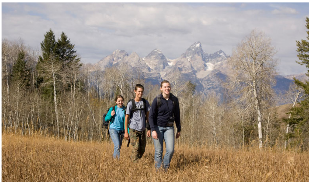
Young hikers in Teton country.