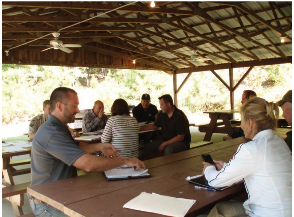
Recent Middle Chattahoochee Management Meeting at McIntosh Reserve.

Assist with the formation of the Advisory Committee and strategic plan and provide technical assistance for the marketing materials.