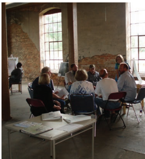
Yellow River Park Community Vision Workshop.

Coordinate the partners to obtain field data, compile the database, create the map, and distribute map and GIS data to all partners.