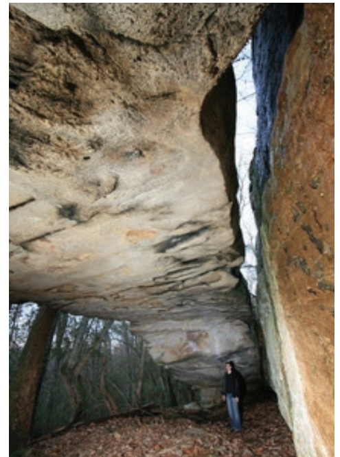
Natural land bridge at Zahnd State Natural Area.

Walker County has since succeeded in implementing the plan by partnering with land trusts and the state. Walker County purchased an McLemore Cove, acre property with the help of the Georgia Land Conservation Program and Open Space Institute, Inc. Walker County partnered with the Lookout Mountain Conservancy to purchase a conservation easement totaling 740 acres from Camp Adahi, adjacent to the Zahnd State