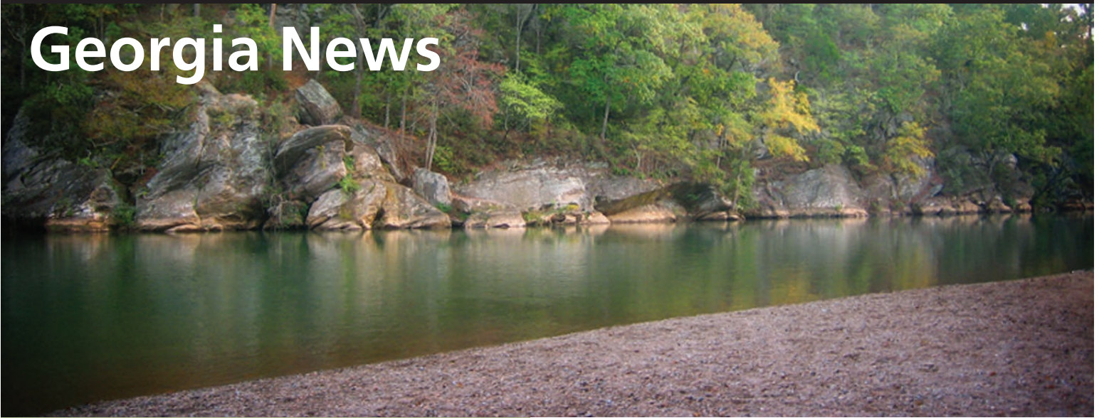
Chattahoochee National Recreation Area.