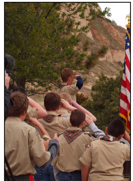
High Plains District Boy Scouts observe Wildlands Stewardship Day at Scotts Bluff National Monument.

The region has been conserved largely because ranchers maintained the wide-open spaces and high quality of the native prairie. These landowners are now working with Platte River Basin Environments, Inc. (PRBE), Nebraska Game and Parks Commission, and The Nature Conservancy to preserve an ecologically