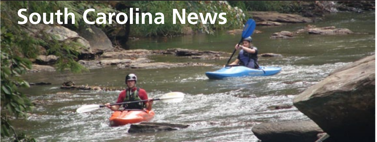
Kayakers on the Twelve Mile River, South Carolina