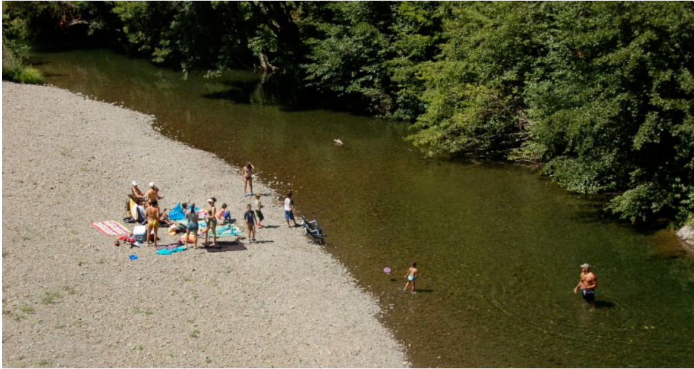
Summer enjoyment on the Navarro River at the Greenwood Road Bridge, Philo, CA.