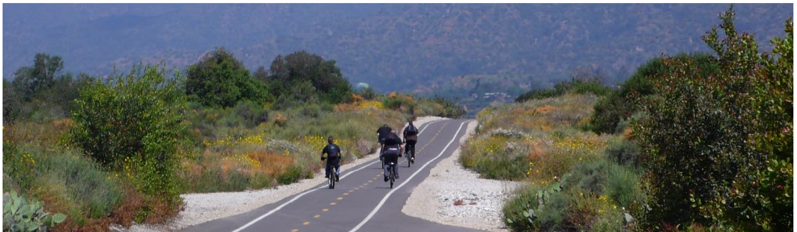
Cyclists riding along the San Gabriel River Trail through the Santa Fe Dam Recreation Area in Irwindale, California.