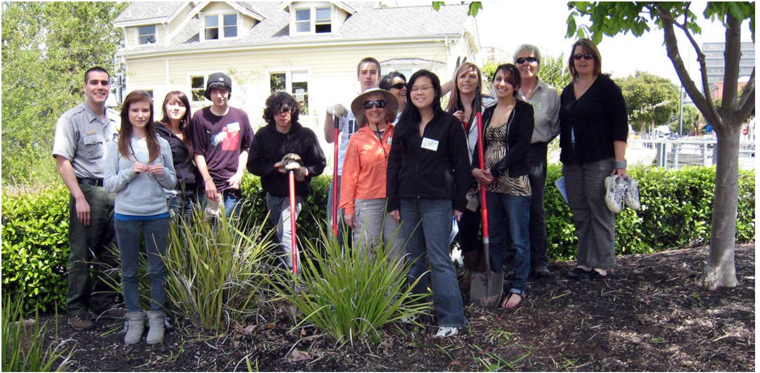
Partners planting the first site along the Alhambra Creek Botanical Trail in Martinez included students and teacher from New Leaf School, Friends of Alhambra Creek, California Native Plant Society, John Muir National Historic Site, and RTCA's Student Conservation Association fellow.