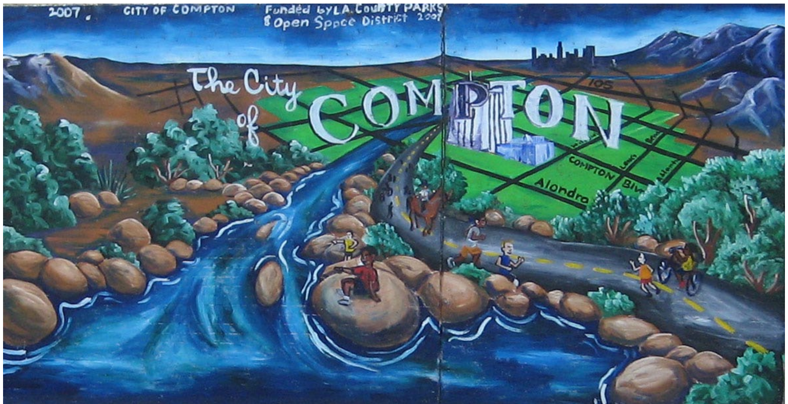
Mural along Compton Creek Trail.

This rail-trail project will focus on a proposed 80-mile rail banked recreational trail between McCloud and Burney with connections to national forest and state park lands, the Pacific Crest National Scenic Trail, and ultimately extending to the communities of Mount Shasta and Weed. RTCA will work with local partners, the Rails to Trails Conservancy, and the community to develop a compelling vision and conceptual trail plan.