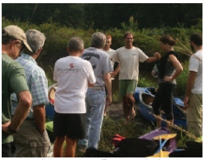
NPS Business Management Office Interns at the Three River Greenway.

Recently, selected as the Department of Interior's America's Great Outdoors Project for the state of South Carolina, the Three River Greenway continues to move forward in developing Congaree Creek Archaeological/Historical Park. Interns from the National Park Service's Business Management Office recently completed a strategic business plan for the historical park which includes a visitor center and 3.5 miles of interpretive trails.