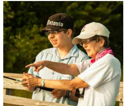
Wheels on Trails' Expanding Horizons Program participants learn to fish along the St. Louis River in Duluth through the Minnesota Department of Natural Resources' MinnAqua Program.

Provide technical assistance, coordination, and facilitation in the planning and National Water Trail designation process. Develop local, state, and regional partnerships.