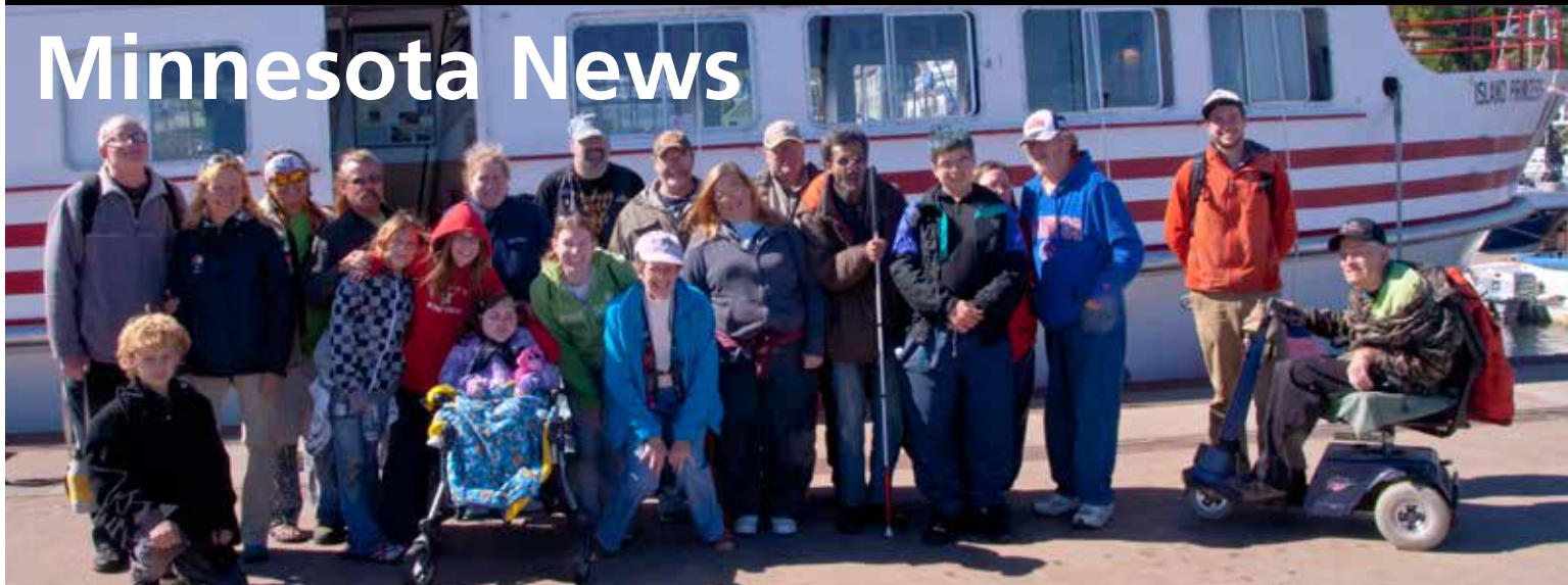
Participants in the Wheels on Trails Expanding Horizons Program enjoy the Apostle Islands National Lakeshore boat cruise.