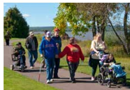
Wheels on Trails program participants experience the Ashland Rail-Trail.

people with disabilities were missing out on the enjoyment and health benefits of recreating outdoors, and founded their Expanding Horizons program a few years ago. In 2012, the NPS joined the effort, providing planning assistance and helping Wheels on Trails identify and obtain a $24,000 grant. This project was developed to creatively respond to the NPS' Call to Action by introducing an underserved, urban, low-income audience to the outdoors.