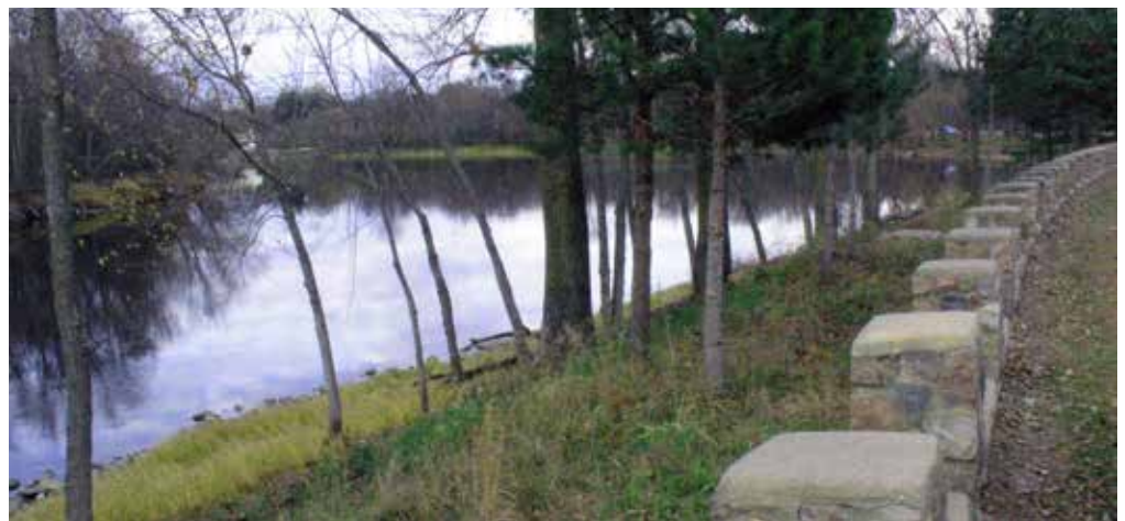
The Mississippi River from Kiwanis Park in Brainerd, part of the riverfront corridor that is the focus of the Bridge to Bridge Revitalization Project.

The future is bright for Brainerd's Mississippi River corridor. No longer is Brainerd known only as "Lakes Area," but now a "Doorstep to the Mississippi" as well!