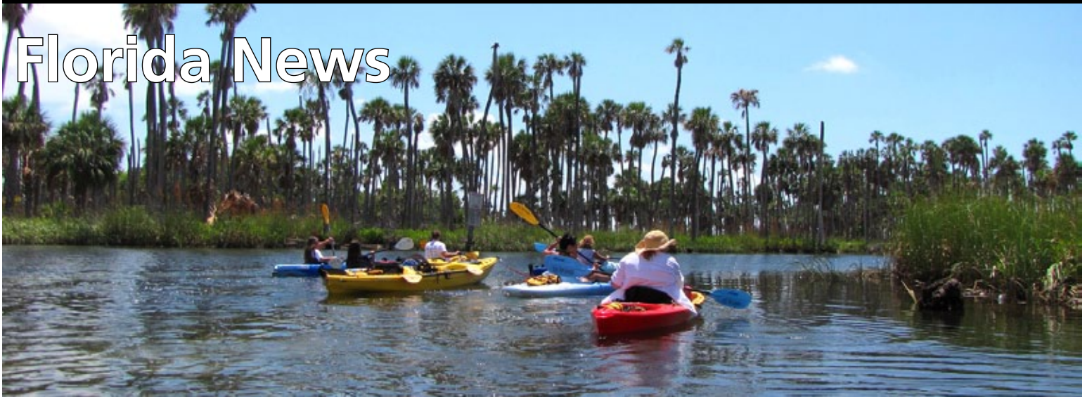
Enjoying the Florida Saltwater Paddling Trail