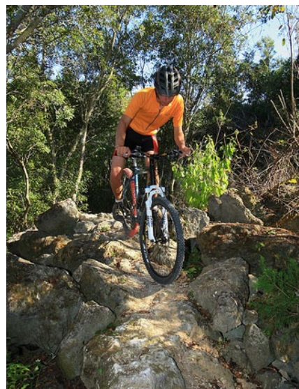
Not everything is flat in Florida! Santos Biking Trails

Assist in the master plan for the Wekiva River System and also help produce marketing and educational materials regarding the Wekiva Wild and Scenic River to educate the public and governing officials.