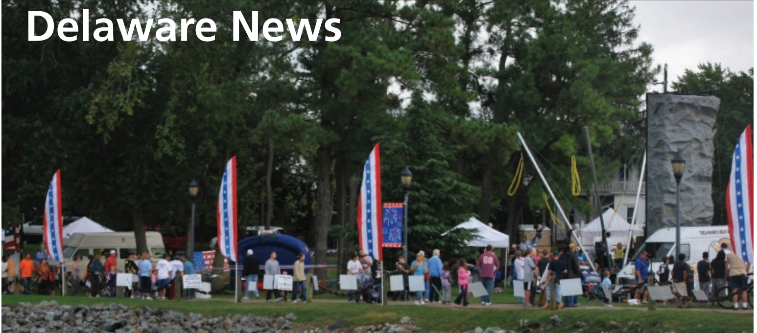
Mispillion River Conservation.