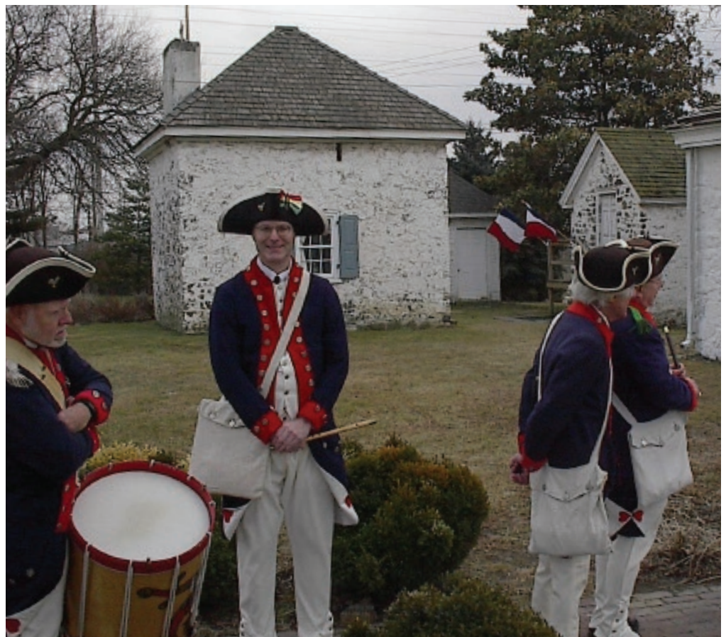
Celebration of the installation of a Delaware historic marker at Robinson House, one of the key stops along the W3R.