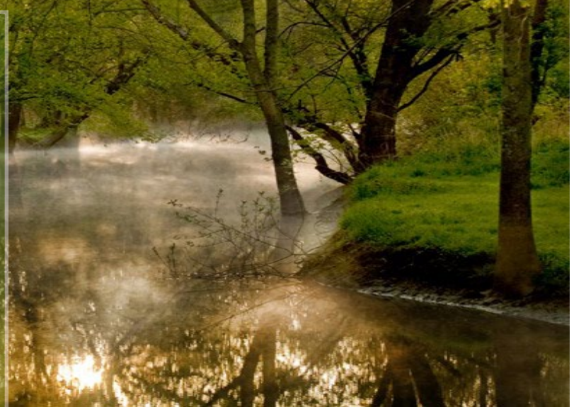
Michigan's beautiful Thornapple River.