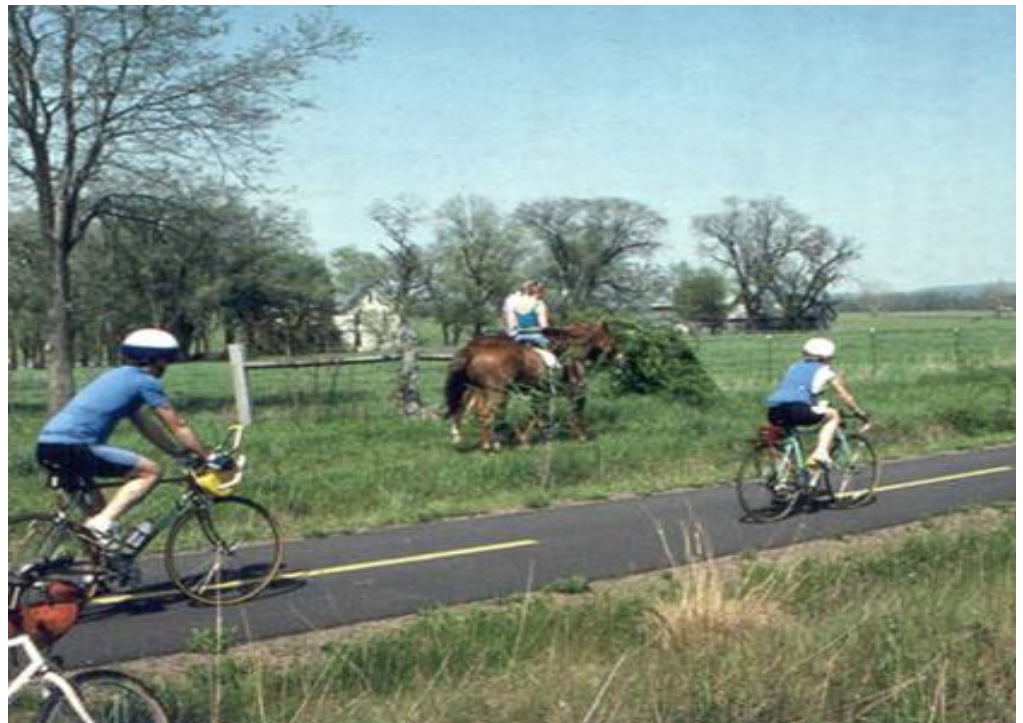
Mult-use trails benefit more recreational users.

Assist with design and development of the planning and public engagement process. Provide assistance with the planning and facilitation of stakeholder meetings around the state and the compilation of data and input from meetings for consideration by the Planning Team.