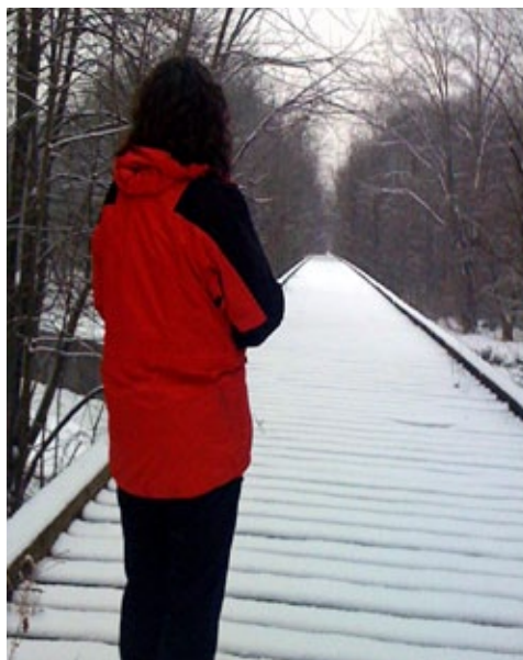
Clinton-Ionia-Shiawassee Rail Trail.

Facilitate a comprehensive interpretive planning process for Fishtown which complements and enhances the programs at Sleeping Bear Dunes NL, Inland Seas, and Leelanau Public Schools