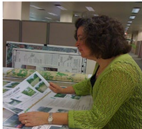
Reviewing planning documents for the Trailway

All the pieces are falling into place for the Clinton-Ionia-Shiawassee Trailway! The Mid-West Michigan Trail Authority (a multi-jurisdictional authority) was formed to manage and maintain the 42-mile state-owned rail-trail. The Meijer Foundation established a $3 million endowment that will provide sustainable funding for routine management and maintenance