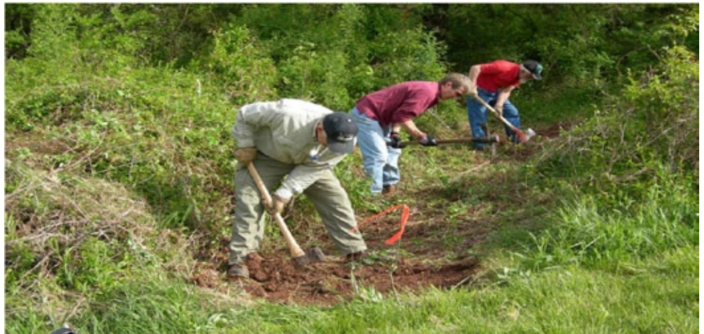
Working on the North Country Trail.

Beyond master plan development, RTCA assistance is requested to assist