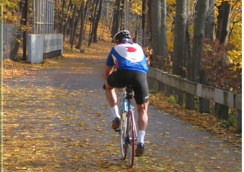
Cycling is an enjoyable pursuit in all seasons.