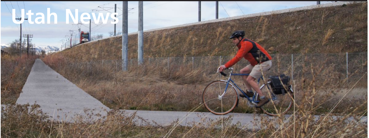
Making the connection from the Jordan River Parkway Trail to public transit.