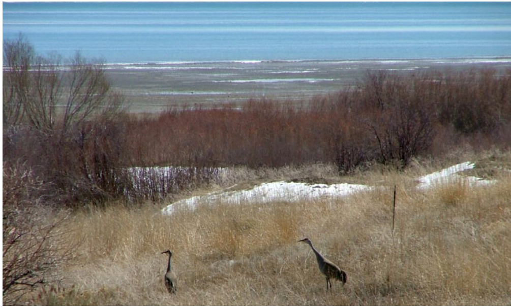
Wildlife along the shores of Bear Lake.