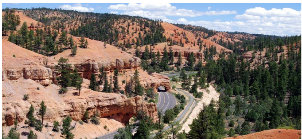
Red Canyon Trail adjacent to Scenic Byway 12 and the Dixie National Forest.

Develop a trail concept plan for five miles of bike and pedestrian trail to complete the Red Canyon Trail from the Dixie National Forest to Bryce Canyon National Park, located in the Mormon Pioneer Heritage Area. A trail concept plan will allow partners to compete for grant funding to hire a consultant to implement the project.