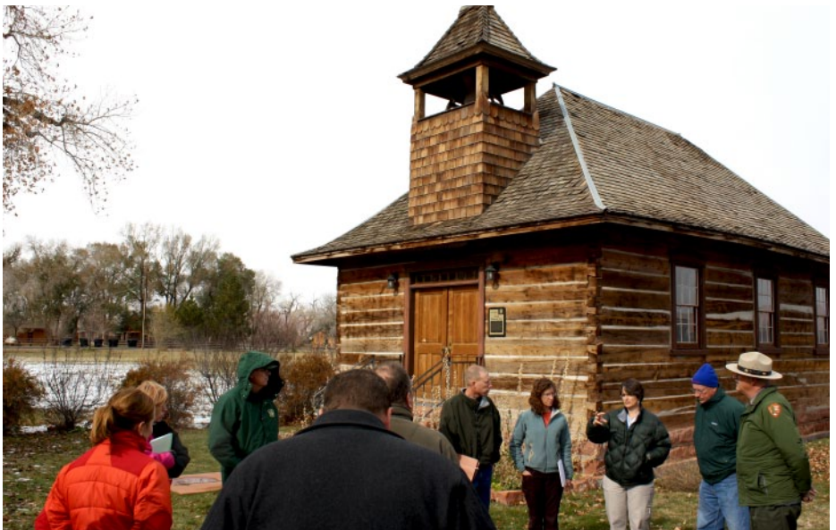
A meeting held in Torrey, Utah to discuss trail planning in Wayne County.

Develop a trail concept plan for a 52-mile pathway, a regional partnership, and a trail committee, that results in implementation of two miles of the trail.