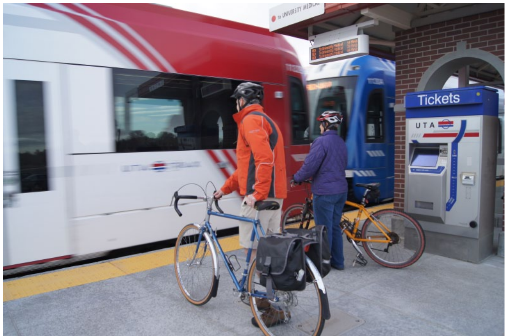
Gardner Village transit stop providing service to Salt Lake City and other areas.

Development of a partnership, facilitation of meetings, trail mapping, identify funding sources, design and graphic expertise, and provide updates on the America's Great Outdoors Initiative. Complete a trail concept plan for West Jordan and Sandy Cities, for one of four remaining critical regional trail gaps, and assist Salt Lake City in identifying funding sources to construct their last remaining 0.5 mile gap in the trail.