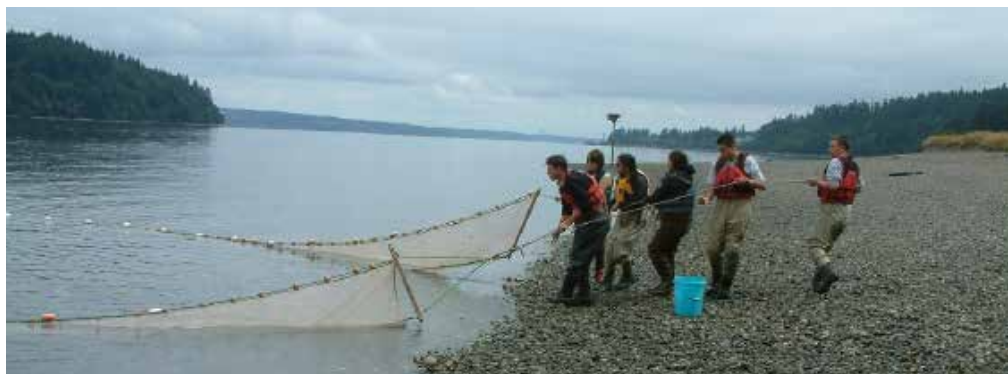
The Nisqually Salmon Camp teaches students to gather and identify fish.

More than $3,000,000 in grants and local funds are implementing Salmon Safe and Forest Stewardship Council certification programs, helping local businesses create sustainable practices, and improving recreation opportunities. Development of climate adaptation strategies, establishing an ecosystem services marketplace, and continuing youth education and stream stewards programs add to the list of accomplishments in the watershed.