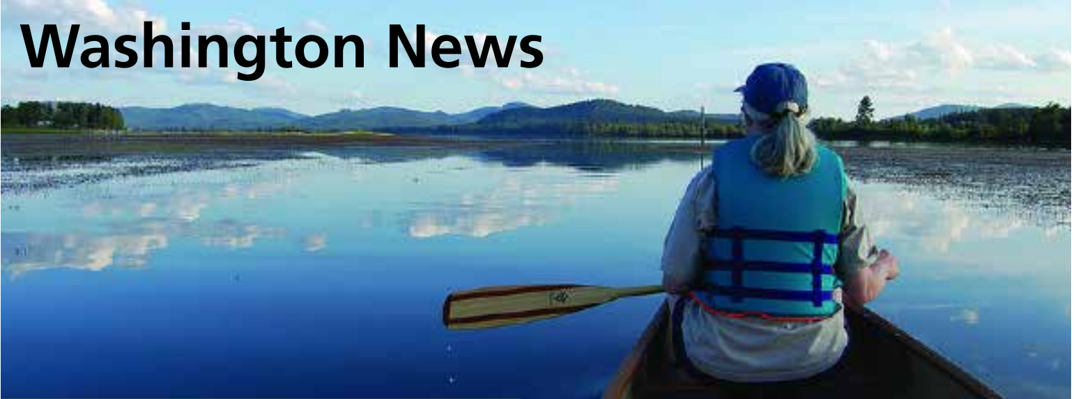
A paddler enjoying a serene day along the Pend Oreille River Water Trail in northeastern Washington.