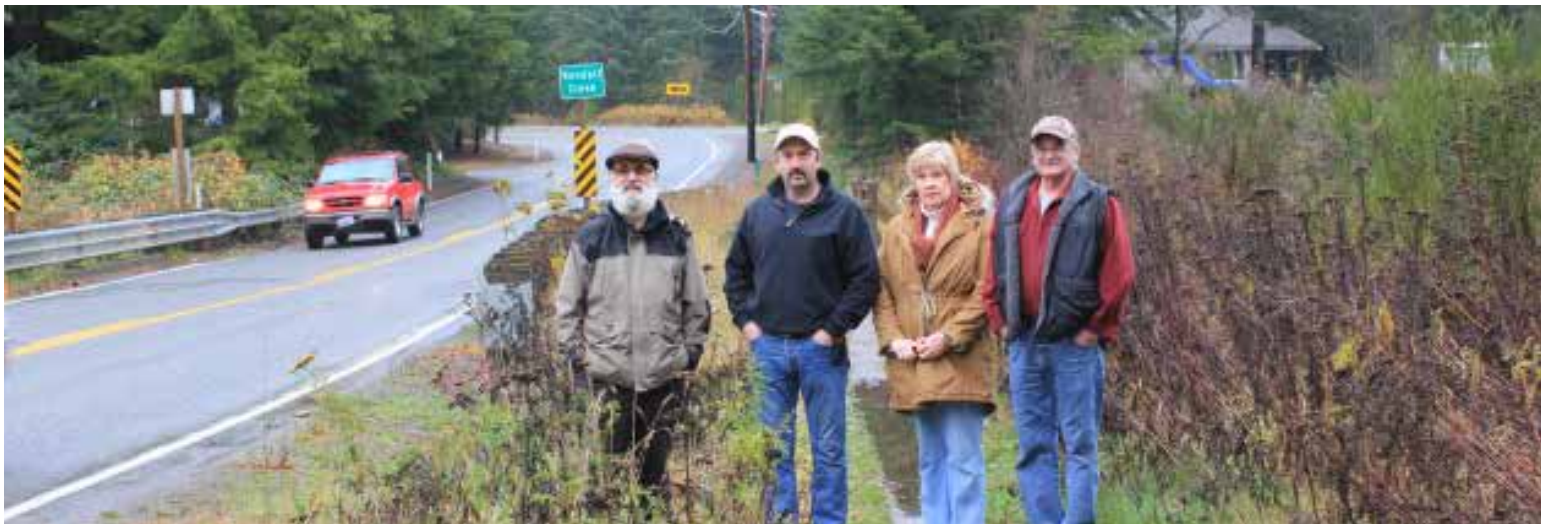
Members of the Columbia Valley Pedestrian and Bicycle Trail Development Committee stand on a section of trail that will be located along Kendall Road.

Work with project partners to plan a public walking trail on port properties.