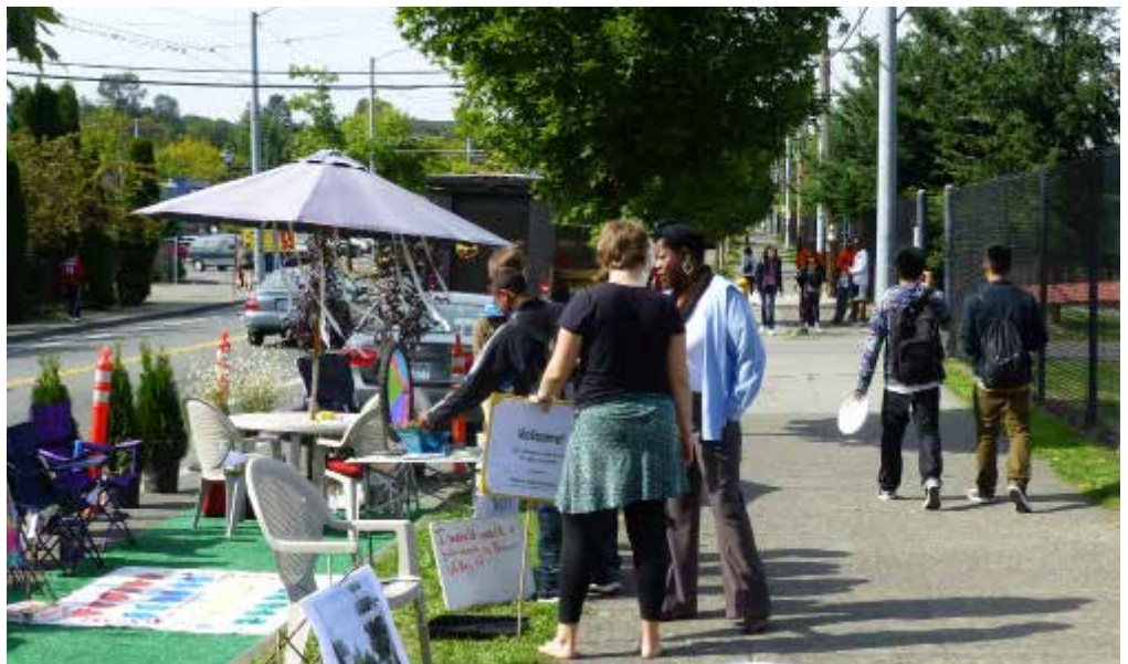
Rainier Valley Greenways partners turn a busy street in front of Rainier Beach High School into a mini-greenway for a day.

A network of neighborhood greenways that connect transit hubs, businesses and community destinations in Rainier Valley.