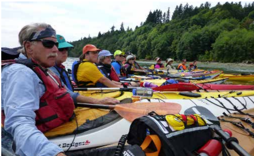
Rafting up on a Paddle Kitsap event.

Develop over six miles of non-motorized trails in and around Lyle.