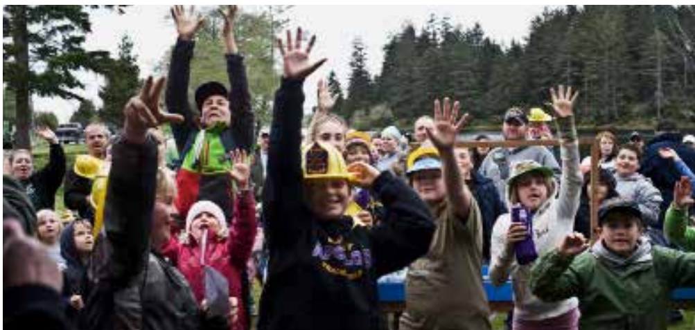
Kids have fun at the annual Fishing Derby at Black Lake Park, Ilwaco, Washington. The NPS is helping project partners create their first Parks and Open Space Plan.

Assist with public outreach and development of a parks and open space plan.