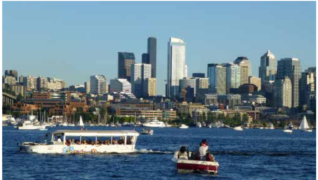
Seattle sparkles from Lake Union, on the Lakes-to-Locks Water Trail. The NPS is helping project partners develop a stewardship plan.

Project Partner: Kitsap County NPS Contact: Sue Abbott Location: Kitsap Peninsula Congressional District: WA - 6