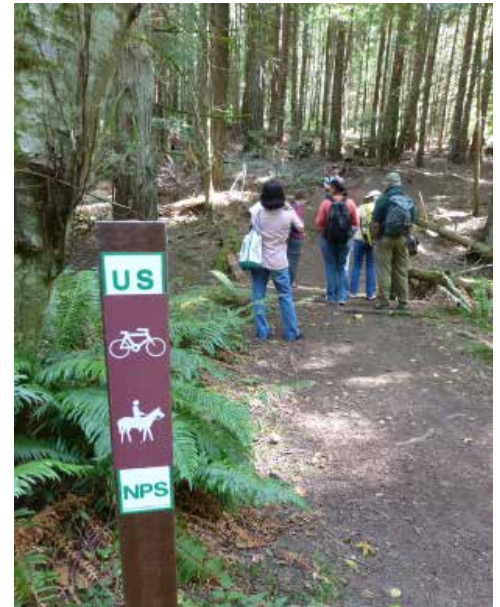
San Juan Island National Historical Park is planning an expanded trail system.

Assist partners with creating plans for both trails and leverage expertise on rail-trail development. Encourage partner participation in a pilot community health assessment using a tool developed by the Centers for Disease Control and Prevention.