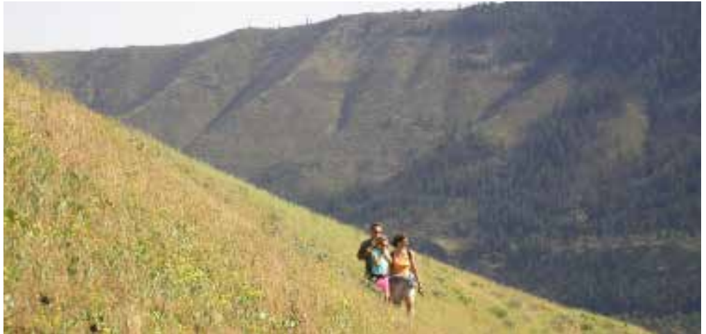
Hikers enjoy panoramic views of the Columbia Gorge National Scenic Area on a community trail system near Lyle, Washington.

Assist with stakeholder and public input on a vision for Cheney's recreation opportunities that emphasize a healthy and active community and celebrate being part of the channeled scablands.