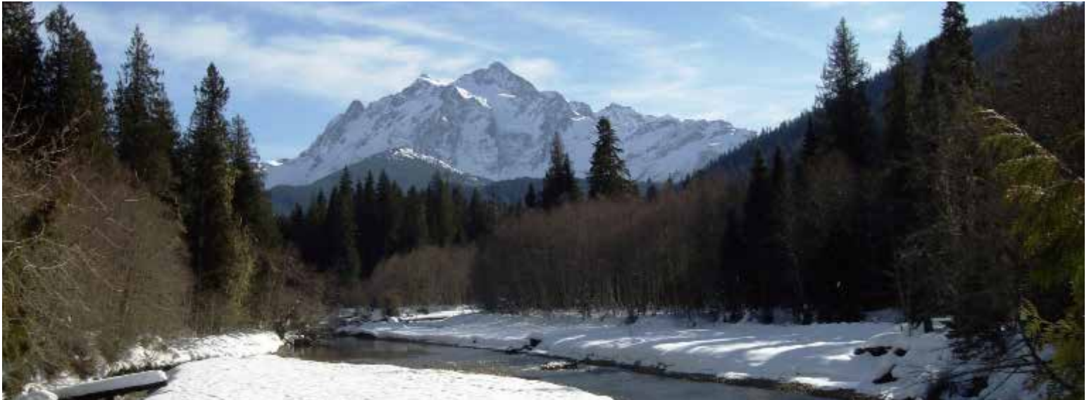
The NPS and American Rivers are working with project partners to develop a recreation plan for 120 miles of the Nooksack River and its key tributaries.