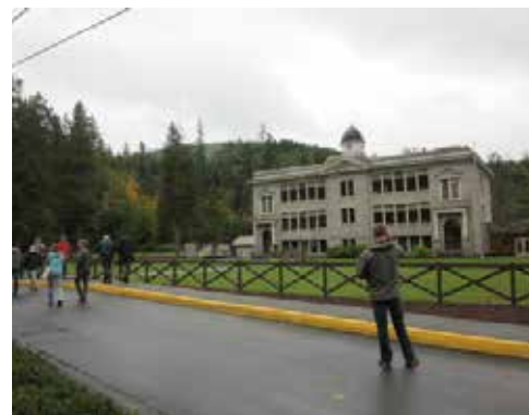
Wilkeson Elementary School is listed on the National Register of Historic Places.

With NPS assistance, a series of inter-related brochures featuring walking tours were created for five historic communities located in the Carbon and White River valleys outside the northwest corner of Mount Rainier National Park. Graphic design and layout of the brochures was provided at no cost through Seattle Art Institute design studio classes and printing was provided through a Boeing Company grant that funded 10,000 copies of each brochure for each community. Together, the tours include South Prairie, Enumclaw, Buckley, Orting, and Wilkeson. Every brochure is unique to each specific town, but all of the communities enjoy a shared regional history. The brochures have been equally popular with residents and visitors traveling through on their way to visit the national park.