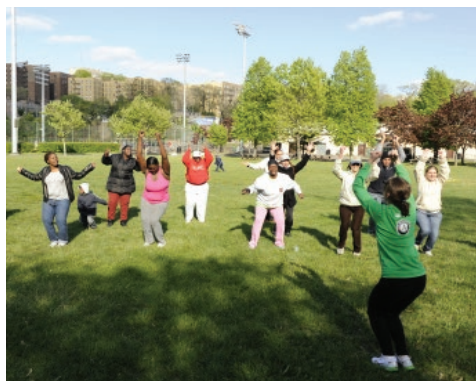
Bronx residents dance to Zumba for "Picture Yourself Healthy in a Park Day" at Roberto Clemente State Park, a key destination on the Harlem River Greenway.

Facilitate community outreach/ involvement, assist leveraging funds, organizational development and capacity building.