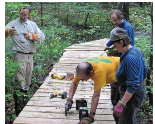
Hyde Park Trails maintenance day.

Assist with three community trail program / events; help to implement first phases of park trails master plan