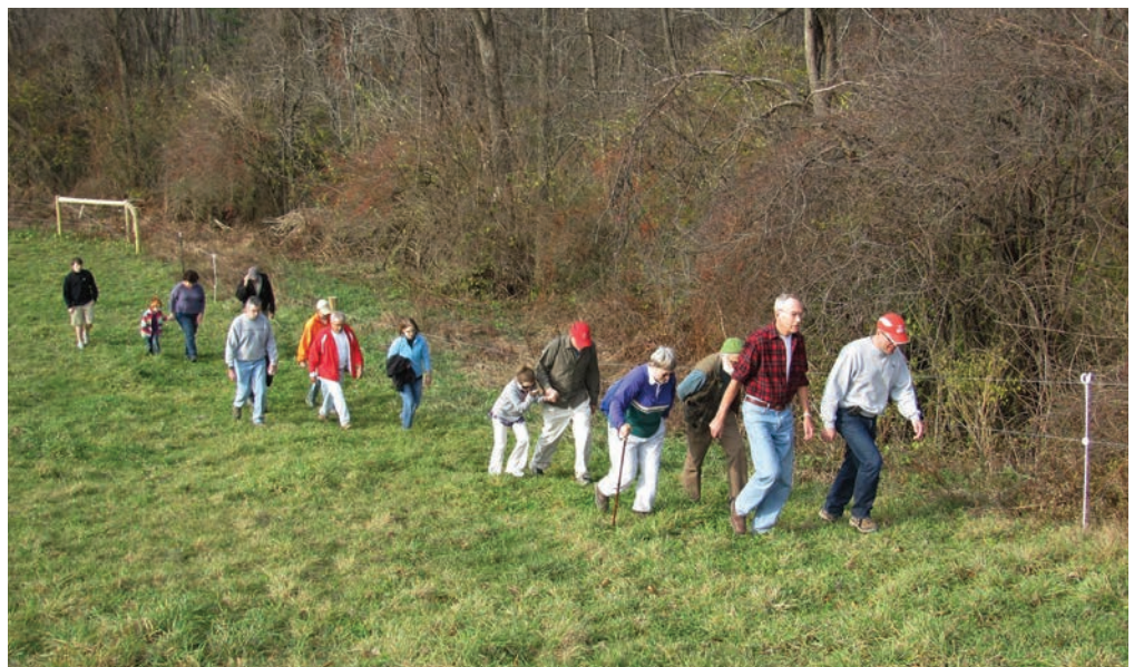
The Dutch Farming Heritage Trail linking Martin Van Buren NHS with Columbia County Historical Society's 1737 Luykas Van Alen House.

Facilitate determination of trail route through New York City and assist in the development of an interim Strategic Plan to improve organizational capacity and ensure quality trail management.