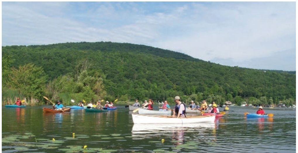
Paddling on Honeoye Lake, in New York's Finger Lakes.

Organize a regional water trail working group; develop shared vision and design standards; help organize outreach events; implement model launch site designs.