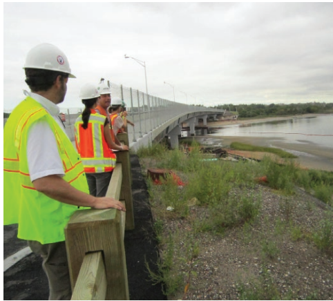
Jamaica Bay Greenway partners assess the feasibility of a bike & pedestrian underpass connecting city and national park land.