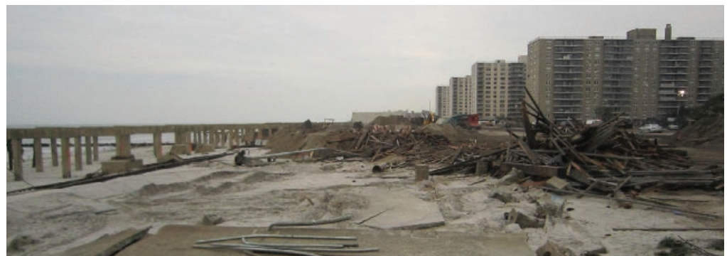
Rockaway Beach Boardwalk before and after Hurricane Sandy. Top left & right: the Rockaway Waterfront Alliance 1st Annual Rockaway Bike Parade, May 2012. Bottom: the Boardwalk at Beach 102nd Street, November 2012.