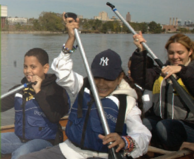
Bronx youth paddle Harlem River at the Harlem River Festival.