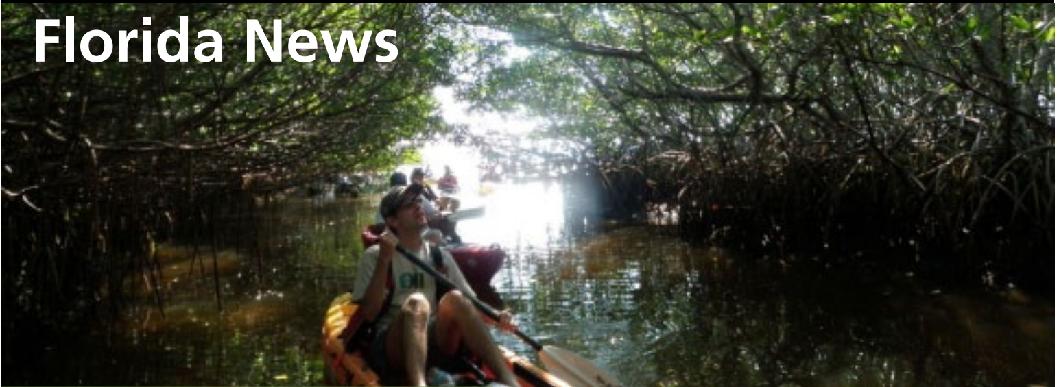
Kayaking through mangroves in Florida