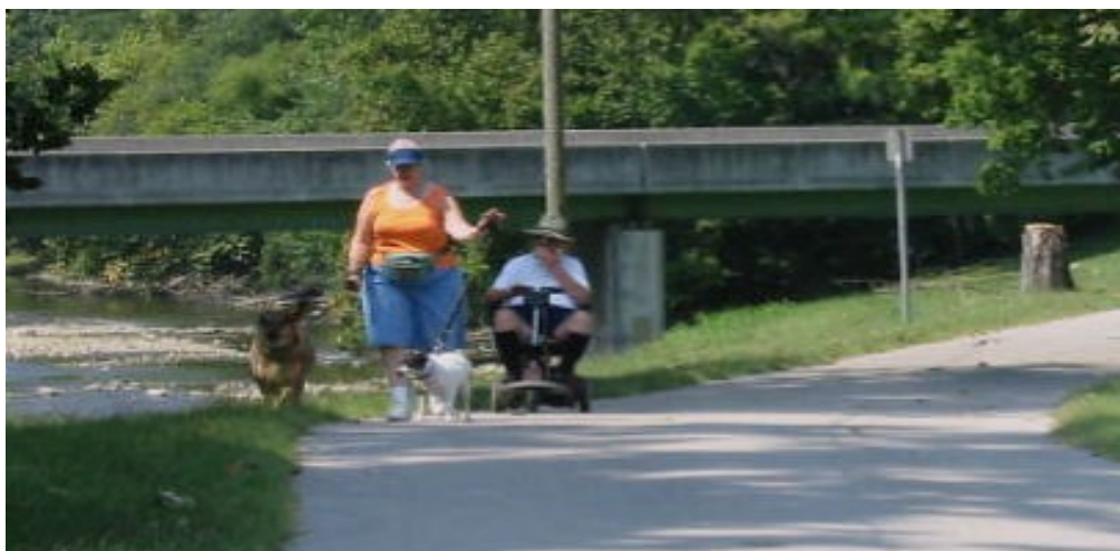
Everybody on the trail for fun and fitness!

To work with Pecatonica River Foundation and other interested individuals to create trail access sites and to complete habitat restoration in surrounding areas of the access sites. Help will be given in finding funding sources,