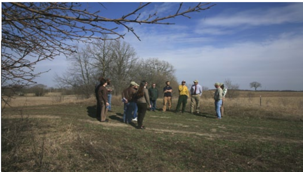
US Fish and Wildlife Service officials visit the proposed Hackmatack NWR area

Build a partnership organization to work on the Lake Michigan Water Trail which will provide access to