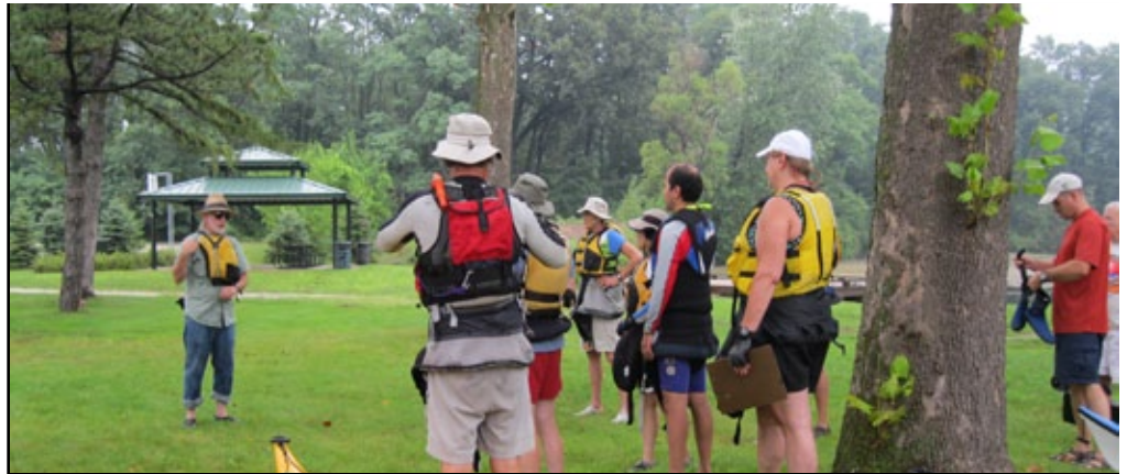
Safety talk before the Kayak Expedition

Convene quad state paddler organizations, local governments and state governments to set vision, mission and goals/outcomes leading to the designation of the 200 mile Lake Michigan Water Trail as a National Recreational Trail.