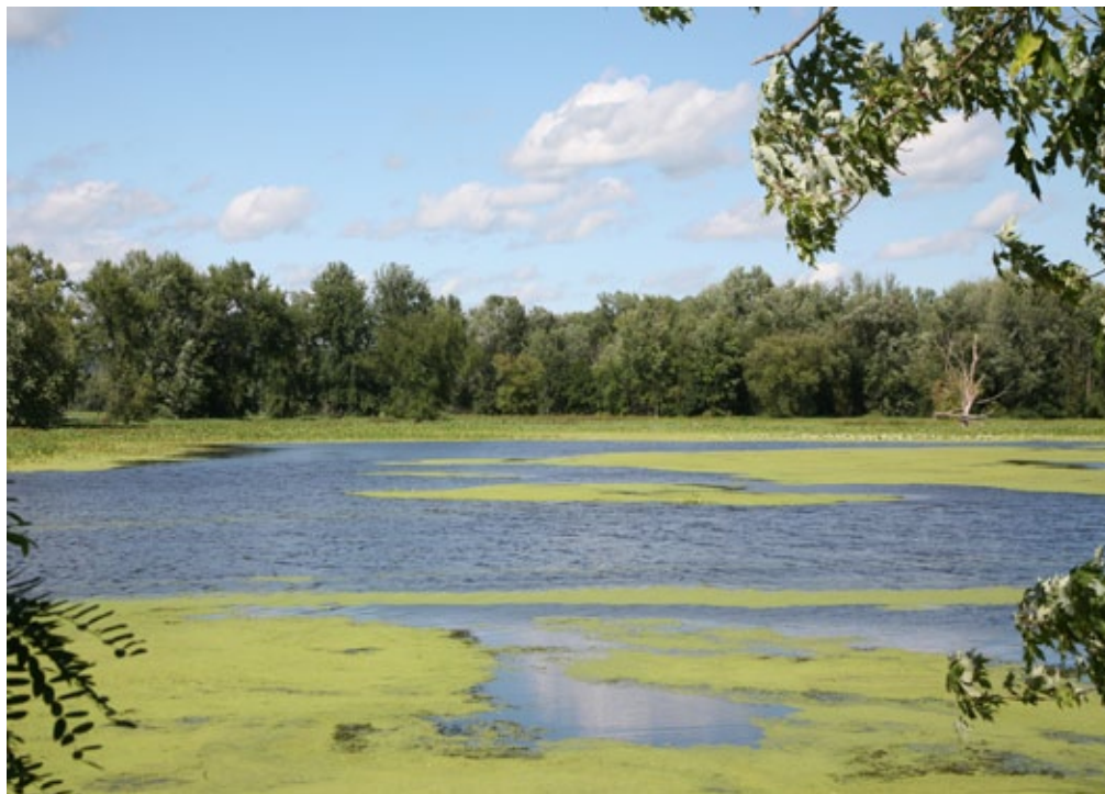
Mississippi River Trail and Collaborative Support planning area

Two additional RVSP demonstration sites along the Chicago River, with eight