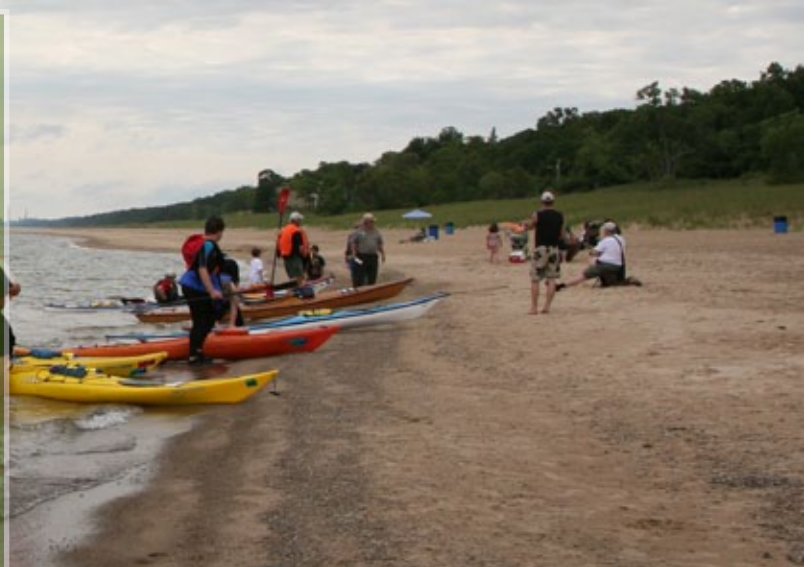
Lake Michigan Water Trail Kayak Expedition - testing the waters on a grey rainy day .