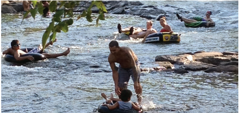
Tubers enjoying Clear Creek in Golden, Colorado.