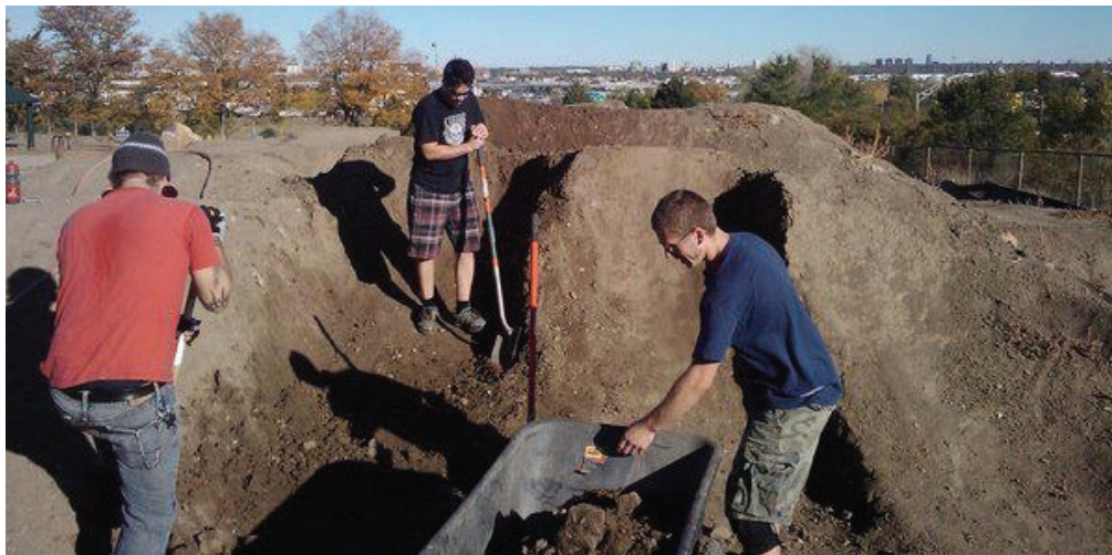
The Friends of Barnum Bike Park worked weekly throughout the summer.

Creation of a Strategic Design & Planning document which guides the planning, maintenance, and stewardship of natural surface trail projects in urban Denver. The strategic plan will include design criteria and trail standards, a community-based stewardship and programming section, and a grant and outreach toolkit.