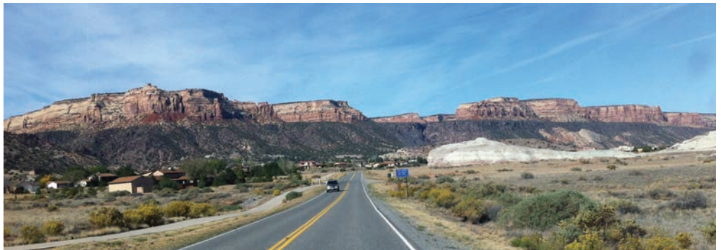
A view of the Monument Road Corridor.

Increased recreational access, improved physical access, and enhanced educational programming related to approximately 6 miles of trail and river.