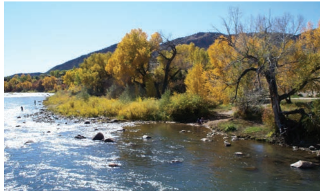
Animas River in Durango, Colorado.

RTCA worked with the City of Durango and other project partners to develop and facilitate a public engagement strategy for the Durango-area community in developing a plan for more than 9 miles of the Animas River.