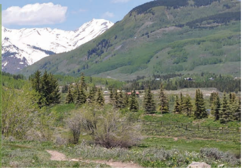
Mountain view from the lower loop of the Crested Butte Perimeter Trail.