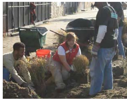
Volunteers plant bushes as part of the Groundwork New Orleans Project

The RTCA provided organizational development assistance to Groundwork New Orleans, one of twelve Trusts in the Groundwork USA initiative working to improve the environment, economy, and quality of life for communities and the first in the Southeast Region.