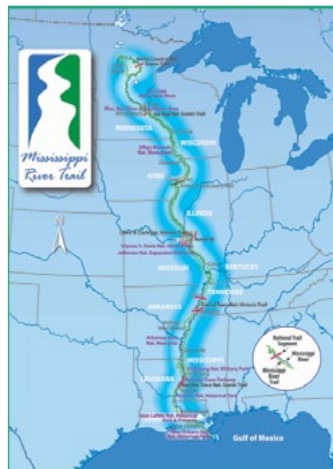
Map showing the proposed Mississippi River Trail

Locally: Develop 71 miles of trail from Vicksburg, MS to Natchez, MS. Nationally: Create a network of 3,000 miles of trail from Minnesota to Louisiana.