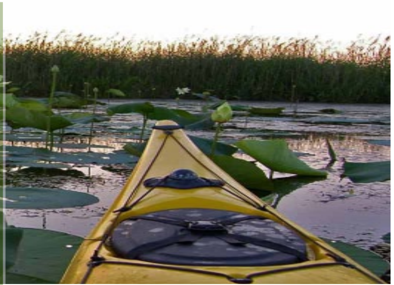
Kayaking along the Pascagoula River, Mississippi