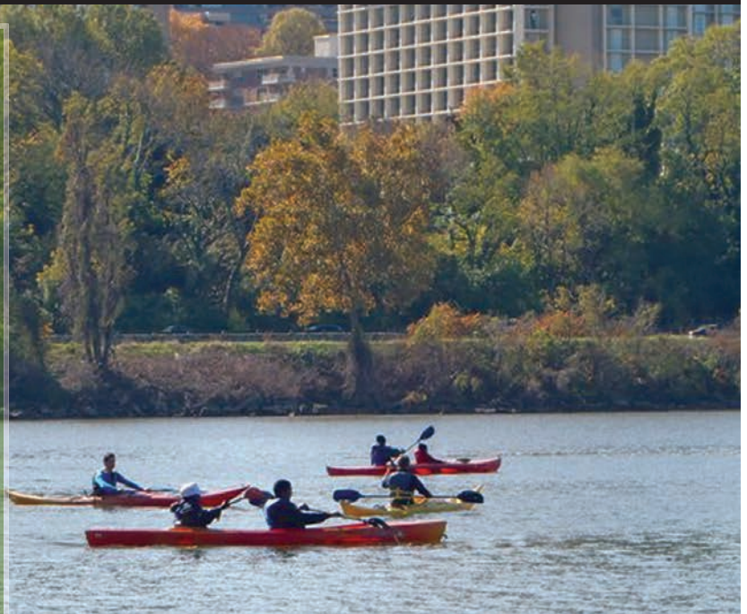
Paddlers, from the Campus Outdoor Clubs Initiative, explore the Potomac.