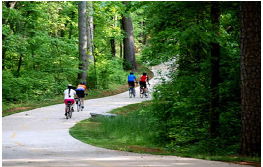
Biking at Panola Mountain State Park