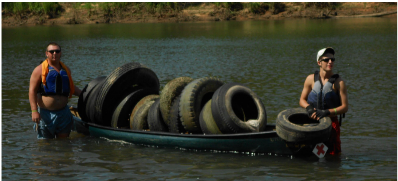
Volunteers for the Georgia River Network take part in a river cleanup

RTCA will manage the project; coordinate the planning team and partners; and help to create promotional strategies, identify funding sources, and build the sustainability for the blueway.