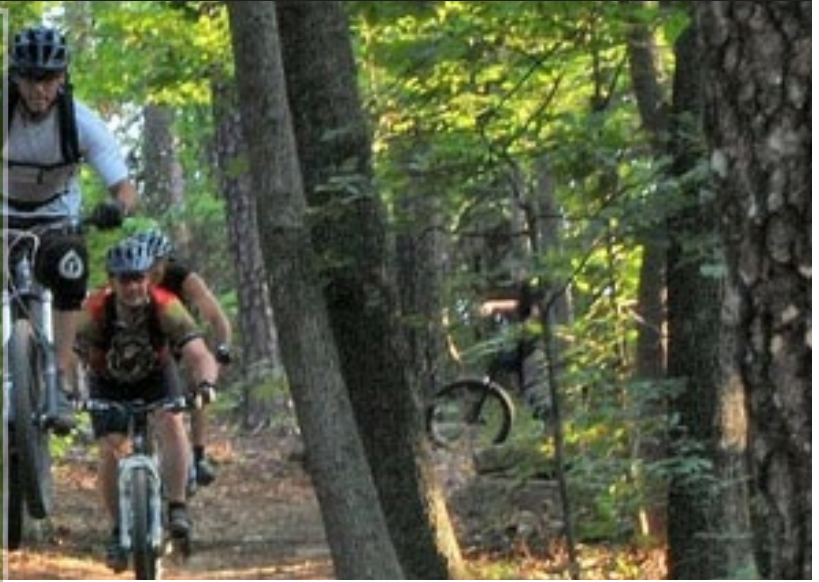
Mountain biking in Roswell, Georgia