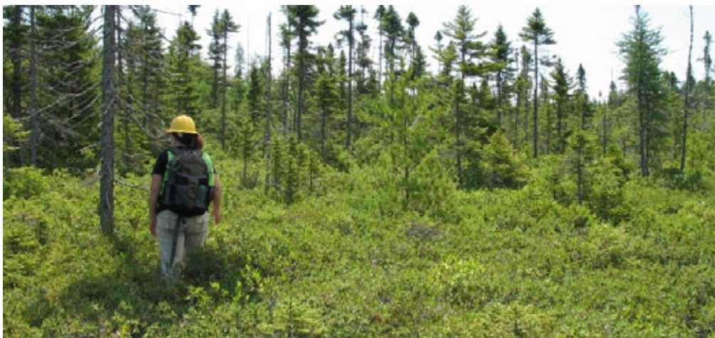
Trenton Village Connector Trail

Project Partner: Sebago to the Sea Coalition RTCA Contact: Julie Isbill Location: A trail connecting Sebago Lake to Casco Bay, generally following Presumpscot River, passing through Standish, Windham, Gorham, Westbrook, Portland and Falmouth Congressional District: ME-1