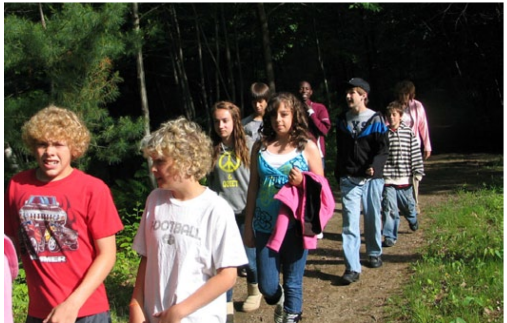
Seventh grade walkers on Riverfront School Trail on National Trails Day

Develop a trail system connecting the Acadia Gateway Center to 217 acres of conservation lands and other locations in Trenton.