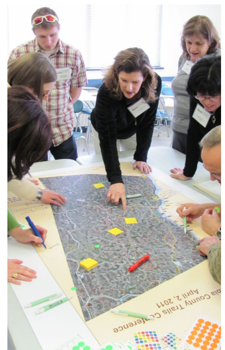
A county-wide trail planning workshop helped people envision the Kinderhook-Stockport-Stuyvesant Trail as part of a larger trail system

A small planning grant enabled the KSS Trail Committee to engage a University of Albany planning studio class to create a trail feasibility study. Public workshops highlighted key issues and problem areas, and also developed some new ideas. As a result, the Committee is moving ahead with some trail sections and carefully reviewing the options for others. The project received the 2011 Outstanding Student Project award from the Upstate Chapter of the American Planning Association.