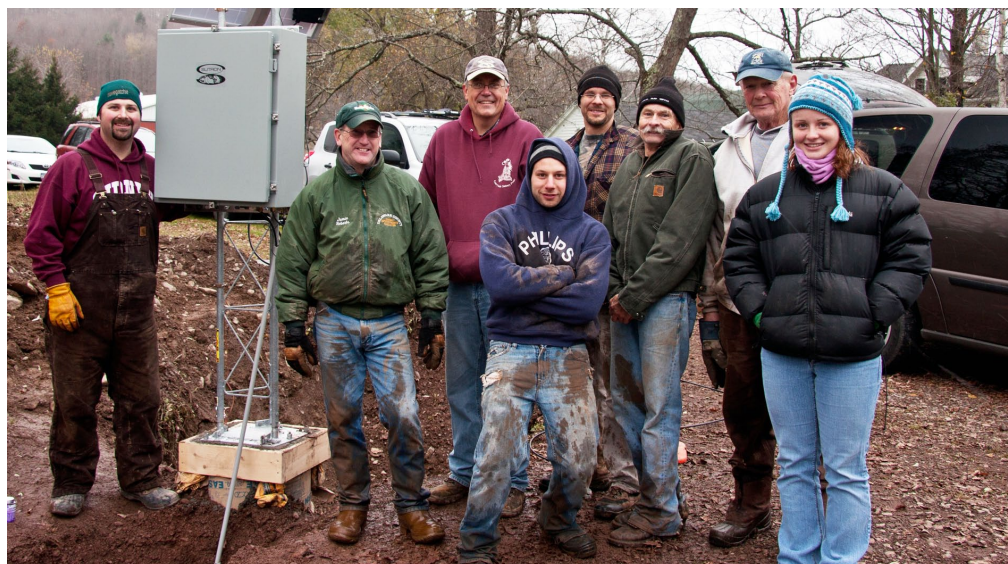
Installation of a stream gage in Carr's Creek to notify Sidney Center residents of rising flood waters was recently completed by representatives of the Sidney Center Improvement Group, Sidney High School, Town of Sidney Highway Department, Sidney Center Volunteer Fire Department and RTCA.

Residents of this forgotten upstate hamlet founded the Sidney Center Improvement Group, developed a vision for its troubled watershed, completed a comprehensive stream corridor assessment, and succeeded in receiving two grants from the National Fish and Wildlife Foundation. The initial grant funded the technical skills of KCI Technologies, Inc. to conduct a hydrologic and hydraulic study to model storm events throughout the watershed and assess the flood potential of specific segments of Carr's Creek and Willow Brook. The second grant provided funds for a larger contract with KCI to assess land and water resources and prepare a plan directing future actions to restore, protect and manage the watershed. This watershed plan incorporates the citizen-led stream assessment findings, hydrologic and hydraulic study recommendations addressing severe flooding, and priority areas for restoration and protection delineated by resource experts and local residents. Grant funds were also used to purchase a satellite flood monitoring station installed on Carr's Creek by teachers and students of Sidney High School.