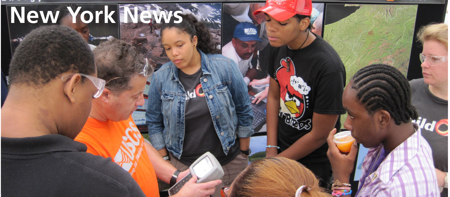
As part of World Water Monitoring Day and the Harlem River Festival, South Bronx youth taking a lesson from USGS on how to track the Harlem River's water quality.