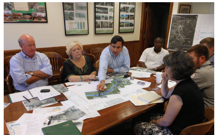
RTCA staff and partners discuss access points and plans for the Chattahoochee River in Valley.

RTCA will assist in the planning aspect of the blueway, provide technical assistance in mapping and safety standards, and facilitate meetings with partners and local communities.