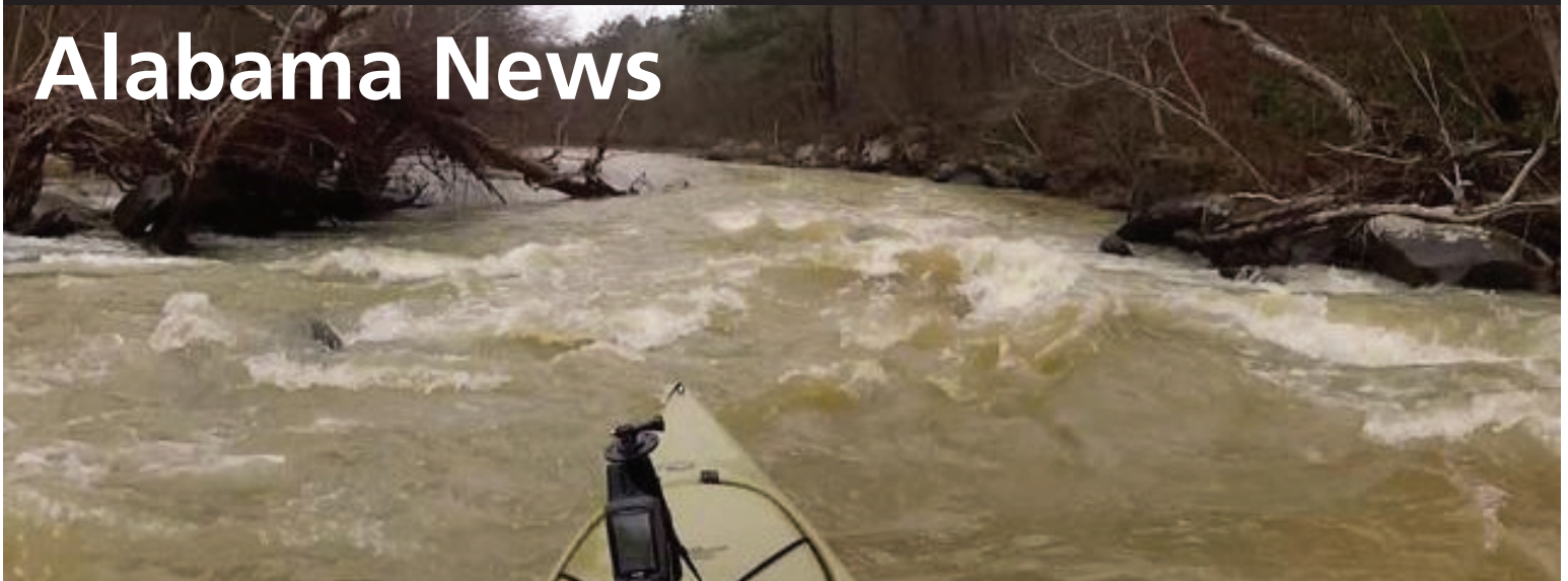
Kayaking down the Cahaba River.