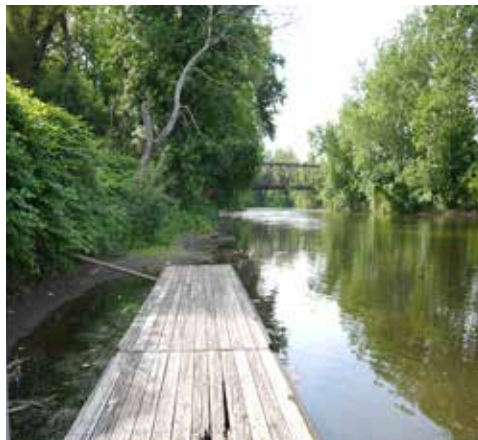
The Mahoning River - awaiting improved water quality, increased recreation, and greater appreciation.

Assist in stakeholder engagement, identify funding and assistance resources, develop partnerships, develop a plan, and facilitation of community and management entities engagement. Working with multiple partners to designate route, develop access points, and create educational and promotional materials.