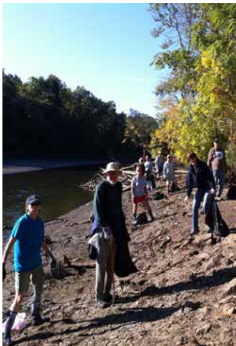
First clean up on the Cuyahoga River after dams removed in Cuyahoga Falls.

Continue to engage trail partners, gather input in the development of a regional trails strategy and to strengthen the Regional Trails Alliance.