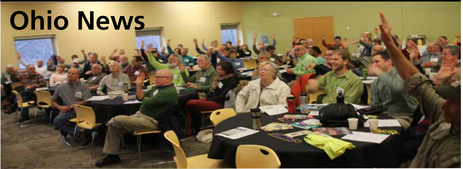
Greater Cincinnati Trails planners, users, and advocates pledging to move trails forward!