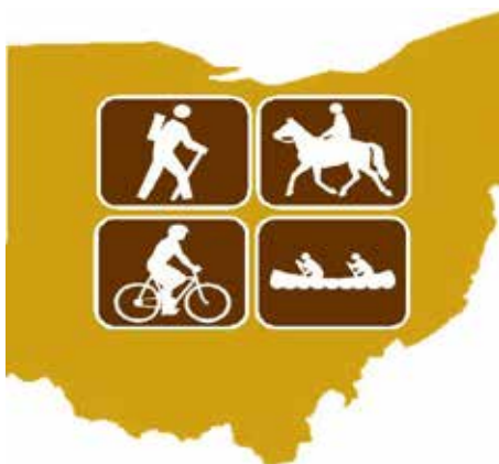
Ohio Trails Partnership logo representing different trail user groups statewide.