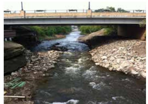
The Cuyahoga River before and after removal of the Sheraton Dam.