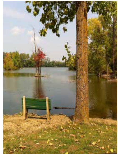
Beautiful Richwood Lake.

Develop a one-mile multi-purpose trail connected to and embraced by the community.