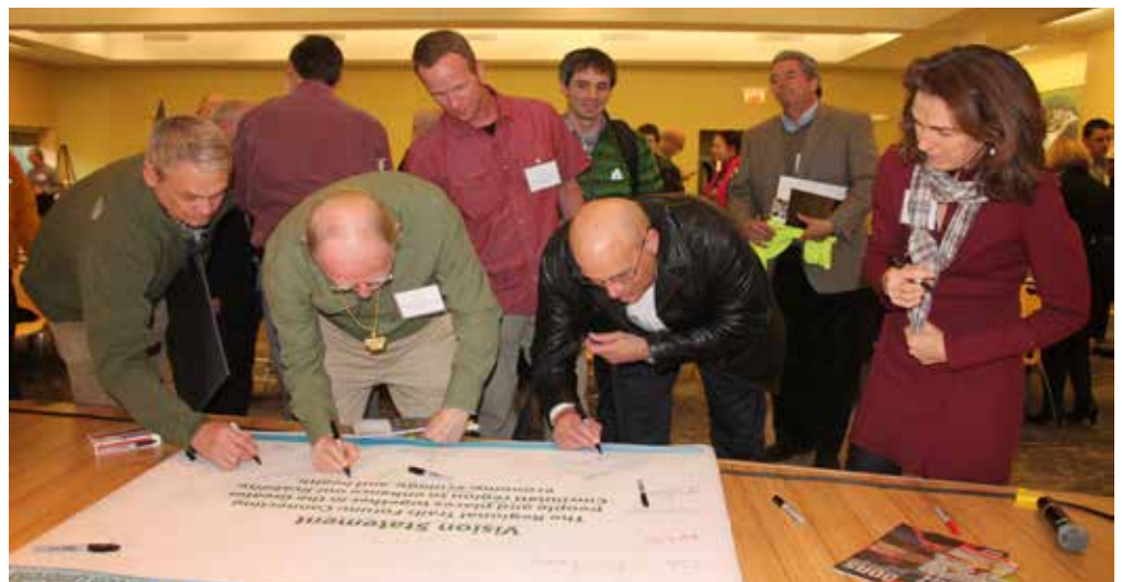
Members of the trails community sign onto a vision statement to connect trails.