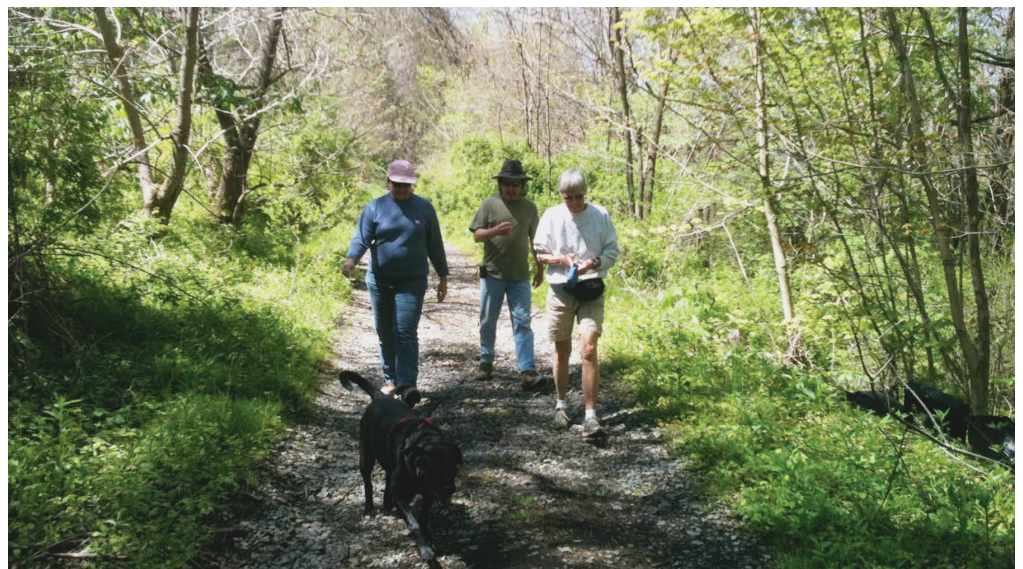
Walkers enjoy the Kingwood Northern Rail-Trail corridor during a Preston Rambles hike.

Facilitate stakeholder and partner involvement, build community support, and develop organizational capacity building.