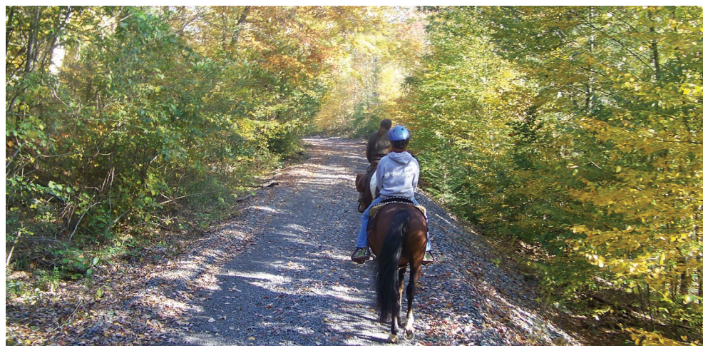
The undeveloped Meadow River Rail-Trail is fine for horseback riding, and affords great views of the river.

RTCA staff participated as a member of Harpers Ferry National Historic Park's Alternative Transportation Study, representing interests and ideas connected with community-park trail connections. RTCA also planned a series of walks with community stakeholders to scope potential loops for the Eastern Panhandle Recreational Trail with community stakeholders. As a result, Harpers Ferry NHP, the Eastern Panhandle Trailblazers, and other community stakeholders are working to create phased trail enhancements.