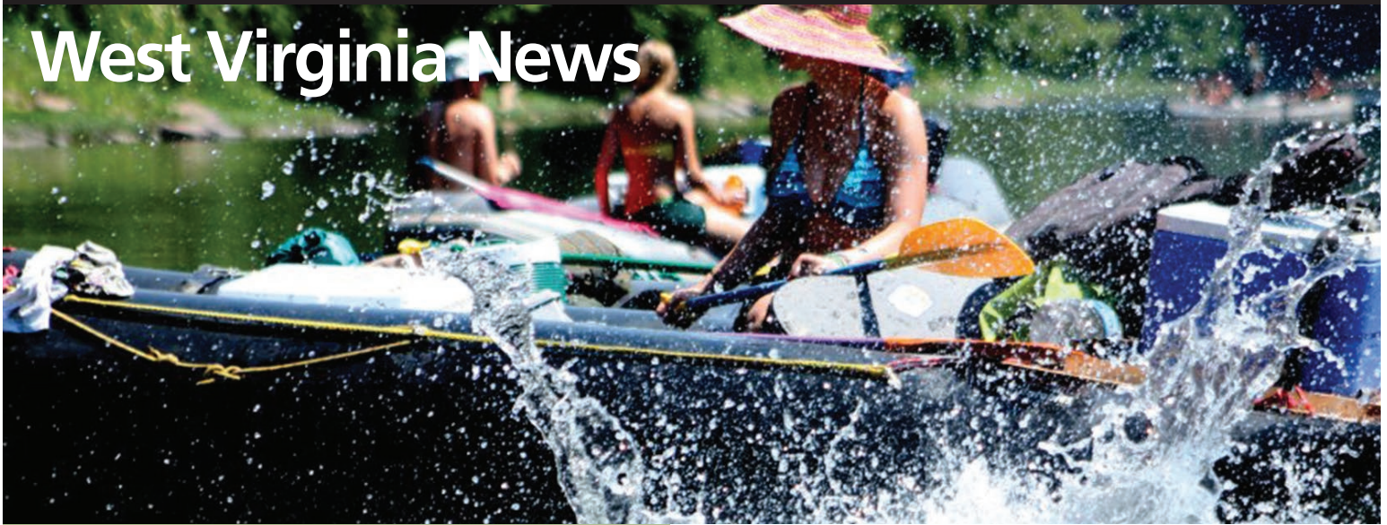
Someone is having way too much fun on the Upper Cheat River Water Trail!