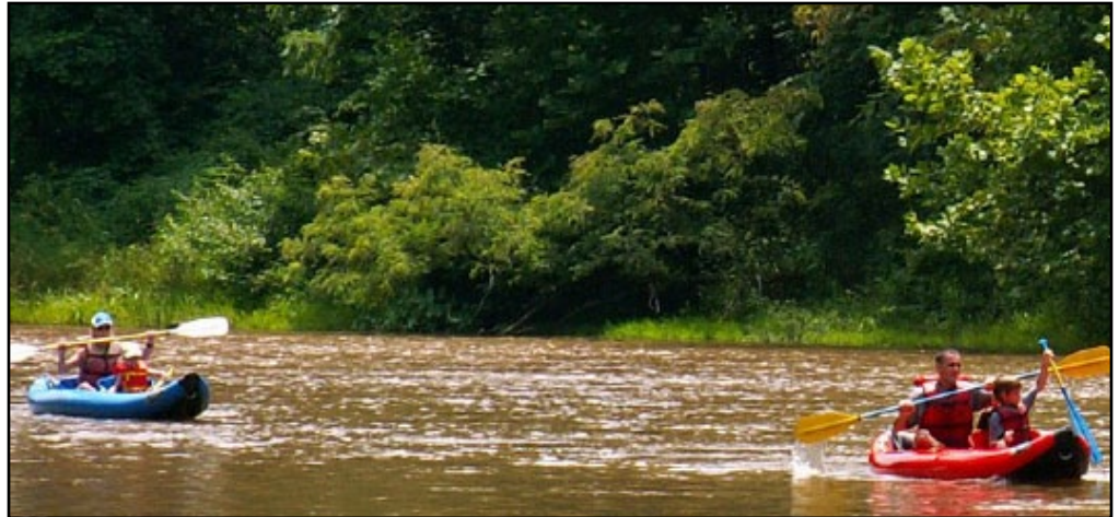
Canoers along the Etowah River

Identify a "main corridor" for a blueway along the coast of GA (and SC, NC, and VA) with existing canoe and kayak access sites and camping/overnight accommodations for day or multi-day paddling trips. A database and website will be created that combines all the information into one centralized location. The Florida Circumnavigation Saltwater Paddling Trail and the Captain John Smith