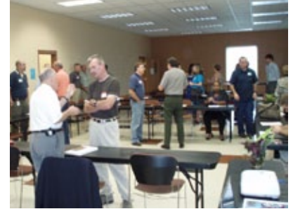
RTCA staff and local citizens discuss the Hawkinsville Pulaski Water front park

River Blueway, a 54-mile water trail on the Ocmulgee River connecting Warner Robins and Hawkinsville in central Georgia.