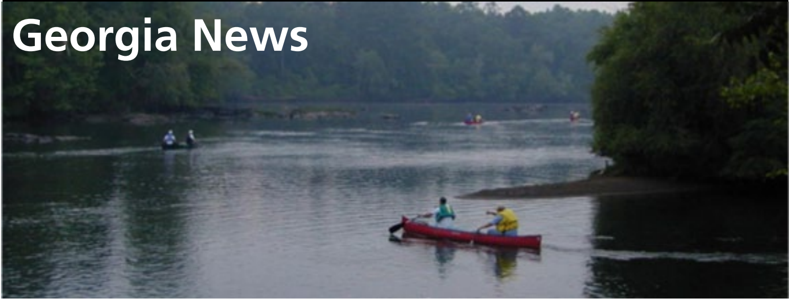
Canoers paddle along the Chattahoochee River at dawn.