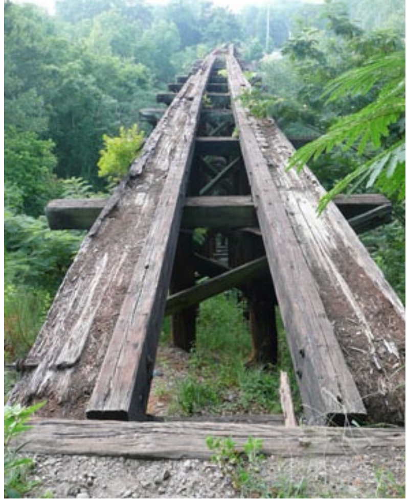
The ‘Murmur’ trestle which may be rehabilitated to become part of the Firefly Rail Trail