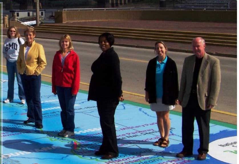
Mississippi River Connections Collaborative Founding Group.