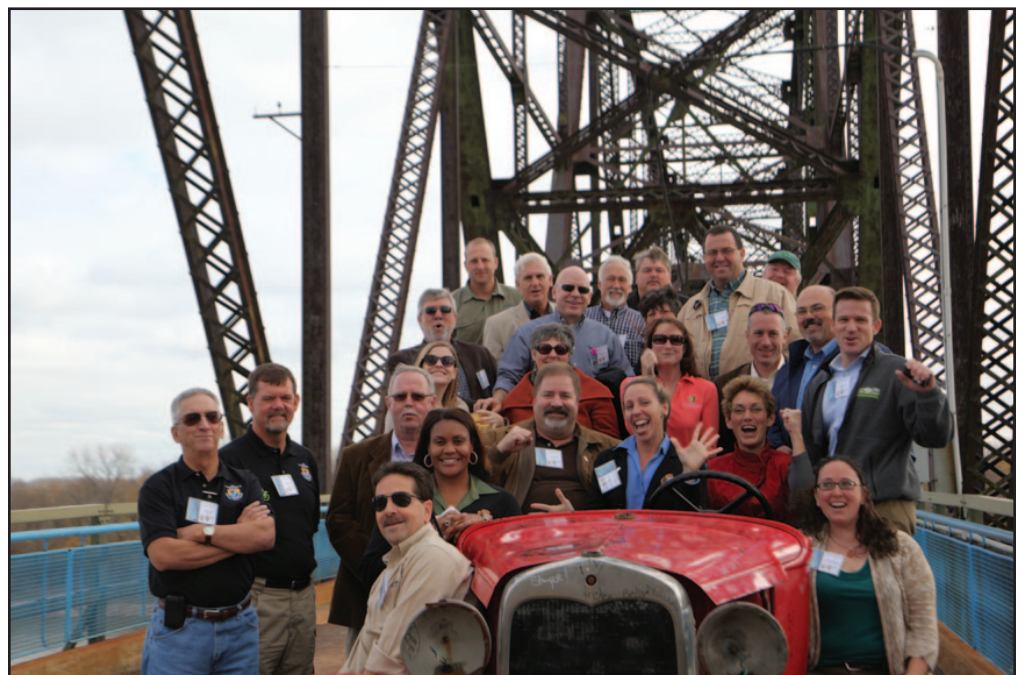
MRCC members “take a ride” on the Old Chain of Rocks Bridge in St. Louis.

The Mississippi River Connection’s lead private partner is Mississippi River Trail, Inc. MRT is a 501(c)3 nonprofit organization whose mission is to be the leader in connecting people and communities with the river through promotion and development of separated trails and on-road cycling routes.