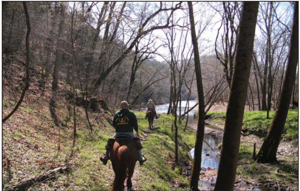
Equestrian Trail at Big Creek.

Rebuilding parks and trails was noted as a priority by Joplin residents in public input sessions held in July 2011. RTCA will provide assistance with the review of park reconstruction plans, identifying funding opportunities, and with partner engagement and public outreach.