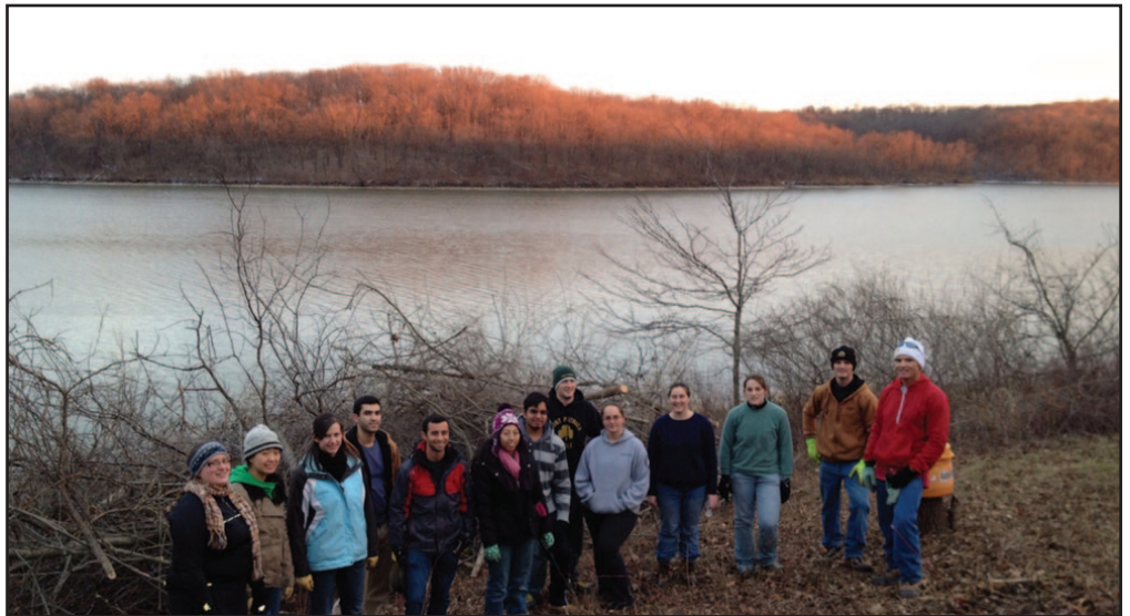
Volunteers help with trail clearing at Thousand Hills State Park.

RTCA will work with the FLATS team to develop a Master Trail Plan for a multi-use trail system connecting the city of Kirksville, MO with Thousand Hills State Park, to reach out and seek input from the local community in the planning process, and to identify potential sources of funding for the project.