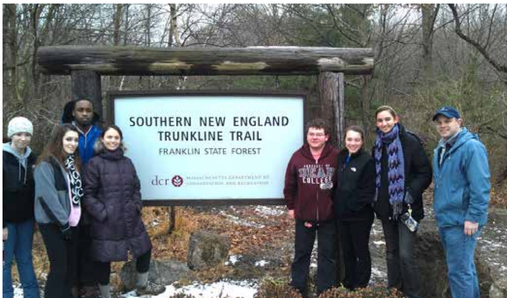
Dean College Outdoor Recreation Club has volunteered to work with the Franklin and Bellingham Rail Trail Committee.

Share successful strategies for engaging public support and volunteers in the trail improvement projects. Identify funding resources for trail-related facilities.