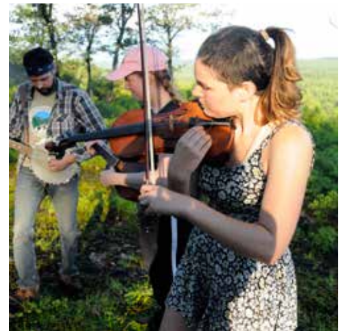
Massachusetts Walking Tour Concert at Richardson-Zlogar Cabin in Northfield.

Assist the Trail Stewardship Council with trail corridor land conservation, natural and cultural resource interpretation, public outreach, and trail management.