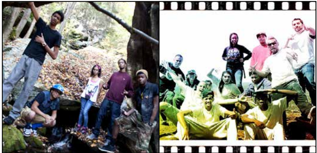
NPS Youth Ambassadors on the New England Trail.

A new hip hop music video about adventure along the New England National Scenic Trail (NET) is creating a buzz among young people. Produced by the National Park Service Youth Ambassador Program (YAP), the storyline for the video is inspired by The Matrix . With already 1000 views on YouTube, the YAP video has energized young people across New England to “find their adventure” on the NET. It has even spurred other trails to produce their own dance videos.