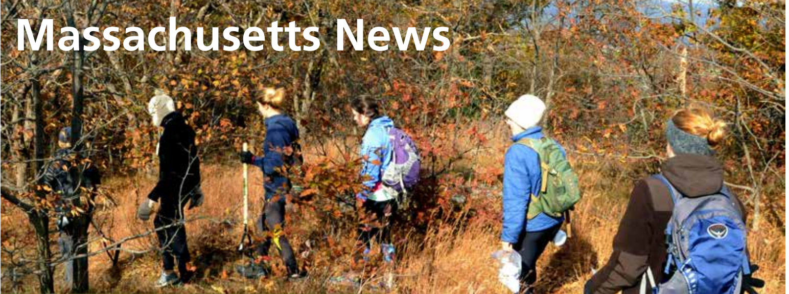
Mt. Holyoke Outing Club hiking the New England Trail.