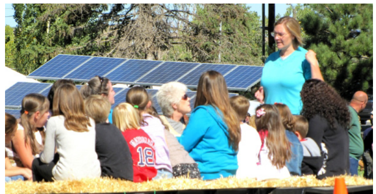
"Let me tell you about Aztec Trails!" -- Learning about trails on an Aztec Oktoberfest hayride.