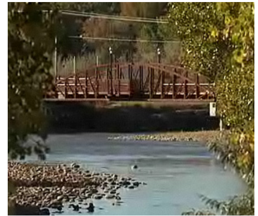
Animas River Pedestrian Bridge.