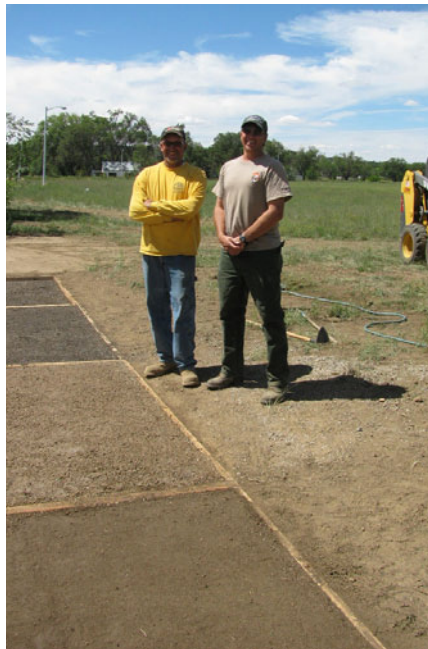
Completing trail surface test project in Cuba.

Most importantly, a pedestrian bridge adjacent to Aztec Ruins National Monument is now in the engineering and design phase. Once completed, Aztec citizens will have a riverfront trail system that connects its most significant community assets.