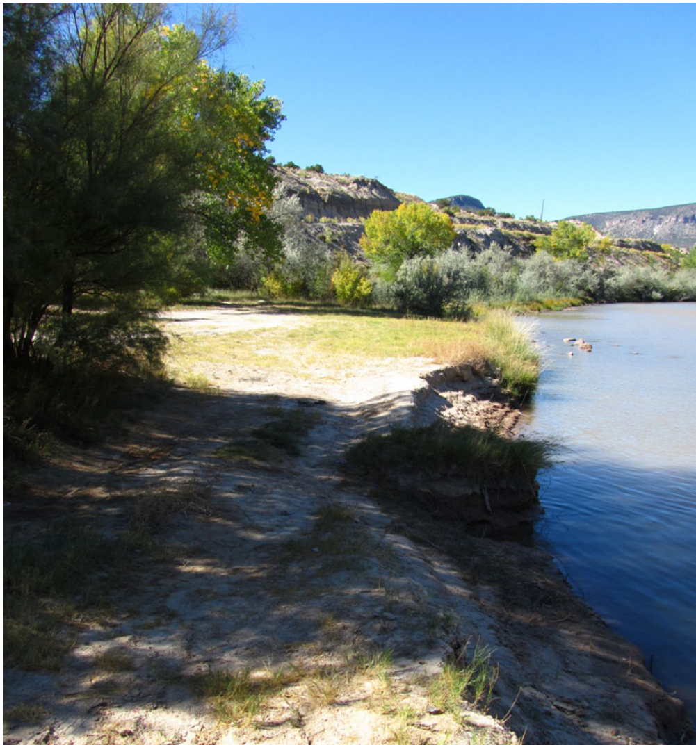
The Abiquiu Open Space Project looks to develop 21 acres of riparian habitat along the Rio Chama in Abiquiu, NM.