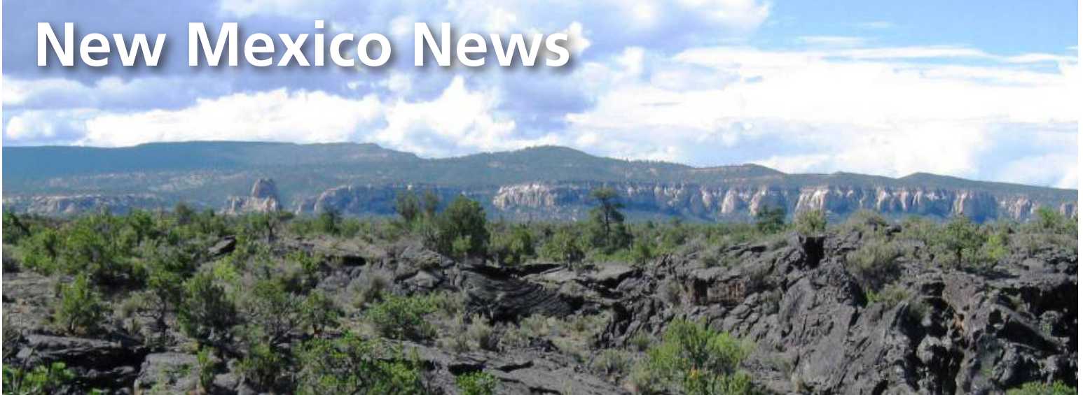
Views of Las Ventanas Ridge from El Malpais National Monument.