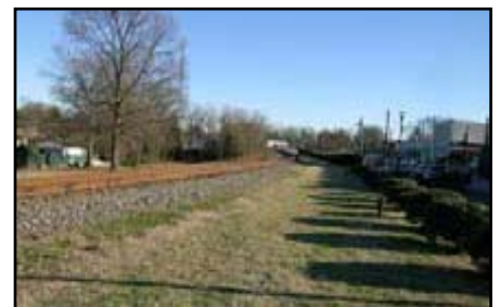
A proposed area of track that will be converted into the Inman Rail trail

To work through the visioning process with the community to determine the best use of recent floodplain buy-out property.