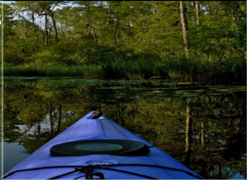
Waccamaw River, South Carolina