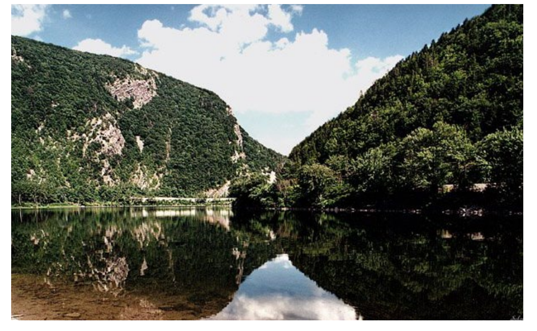
Delaware Water Gap

Create a trail network of over 100 miles in PA, linking to the Highlands Trail in NY and NJ, that provides communities with close-to-home recreation opportunities.