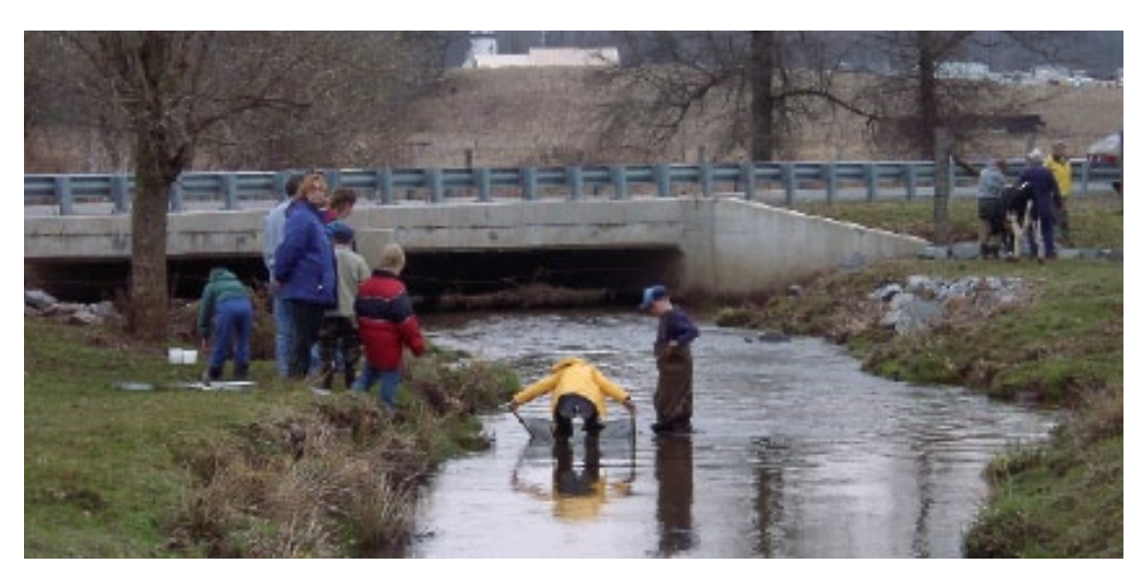
Cub Scout Troop water monitoring the Schuykill River

Develop 5 acres of park lands within Derry, and 20 miles of trails linking Derry parks, Chestnut Ridge, and communities of Blairsville and Latrobe in Westmoreland County.