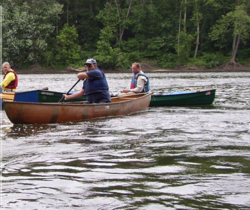
Boat ferry demonstration on the Delaware River Water Trail