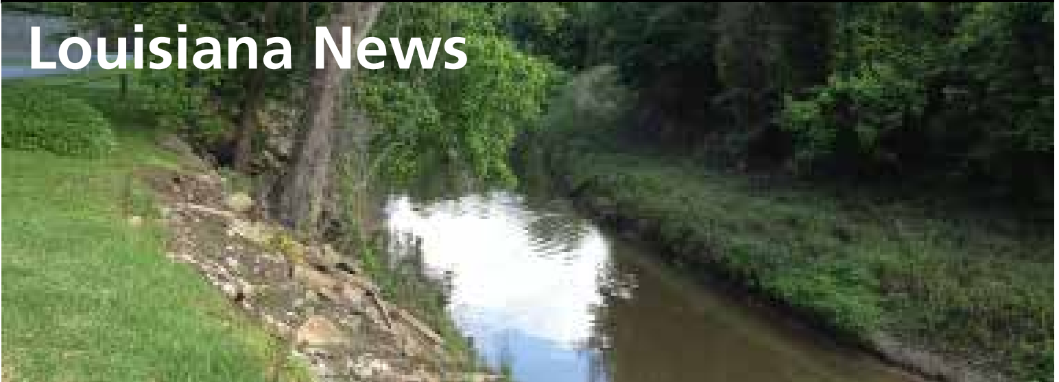
A view of Dawson Creek, Baton Rouge, Louisiana.