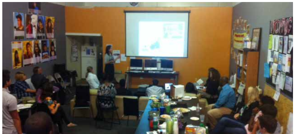
Trail to a Healthy Community Design Presentation.

Assist with community outreach, and facilitate collaboration and agreement between the city and community for a long-term vision for the corridor.