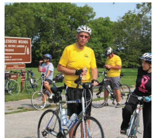
Mississippi River Trail event.

Build a community partnership to develop a county-wide trail master plan that will link residents to their county parks, open spaces, natural features, and other communities in an effort to provide better health, wellness, and economic benefits.