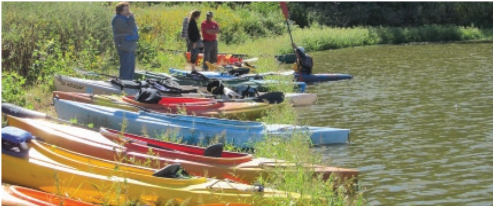
Odessa Water Trail event.