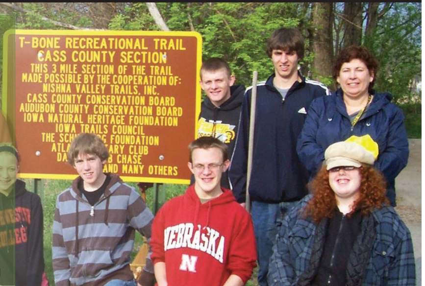
American Hiking Society Service Day.