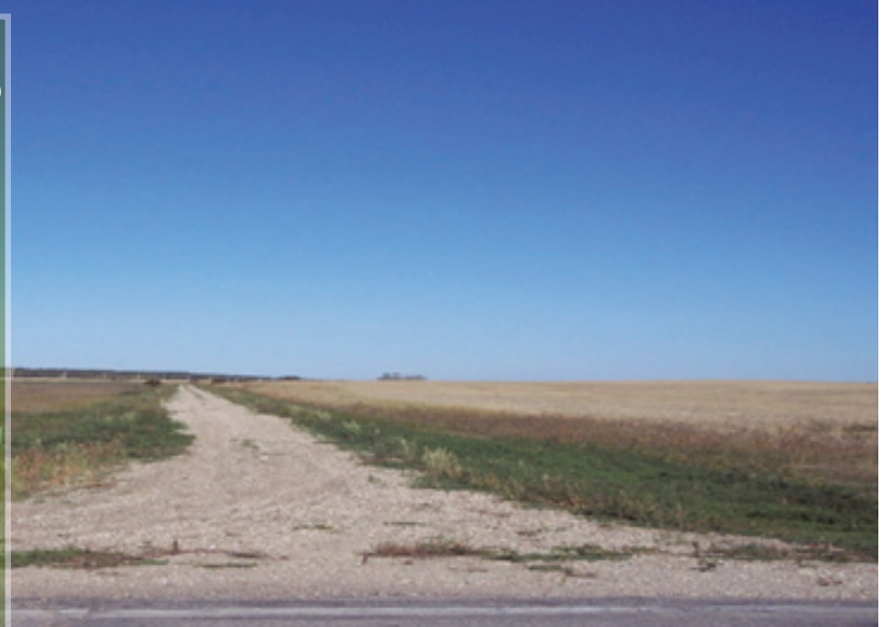
Wakopa Trail.

The Rivers, Trails, and Conservation Assistance (RTCA) Program is the community assistance arm of the National Park Service. RTCA staff provides technical assistance to community groups and local, state, and federal government agencies working to protect natural areas and water resources and enhance close-to-home outdoor recreation opportunities. We help communities plan, organize partnerships, and achieve on-the-ground success on projects they initiate.