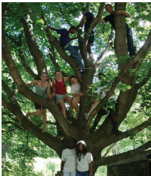
Groundwork Green Team.