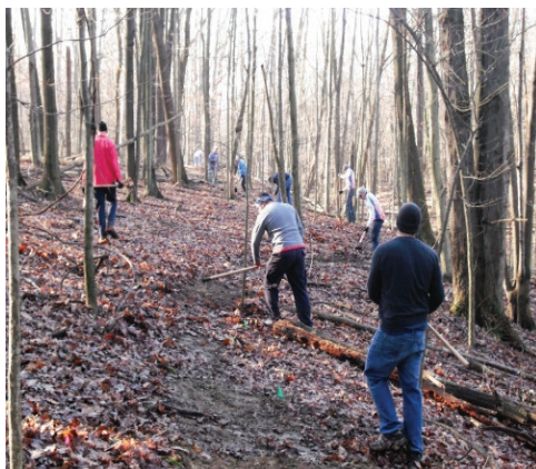
Building Buckeye Trail.

Building the Buckeye Trail Association’s capacity to manage its volunteers more effectively, protect land and promote the use of existing off road portions of the Buckeye Trail, will improve natural resources and enhance outdoor recreation throughout the state for generations to come. This will lead to more trail development as well as trail corridor protection.