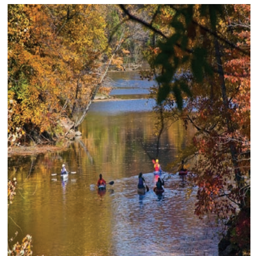
Cuyahoga River Water Trail.

Facilitate the steering committee of the Cuyahoga River Water Trail (CRWT) Partners to build support through public engagement and management partner participation to bring sections “on line” with the branded CRWT designation. Also seek State of Ohio Water Trail and National Water Trail System designations.