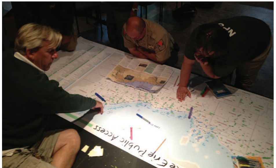
Mapping Lake Erie access points.