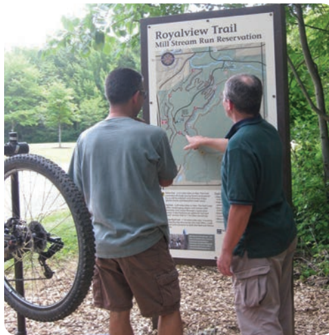
Partners plan out their bike route on a new trail.