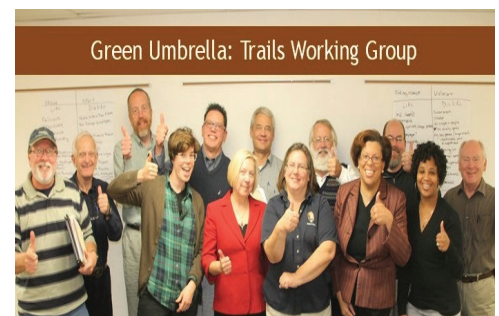
Trails forum at work.

Congressional Districts: OH - 1, 2; KY - 4; IN - 6, 9