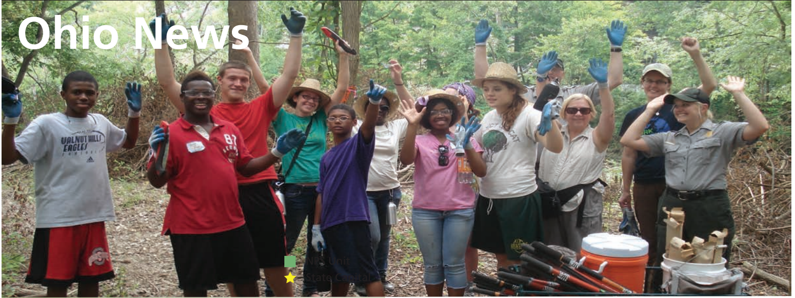
Groundwork Cincinnati Green Team at Cuyahoga Valley National Park.