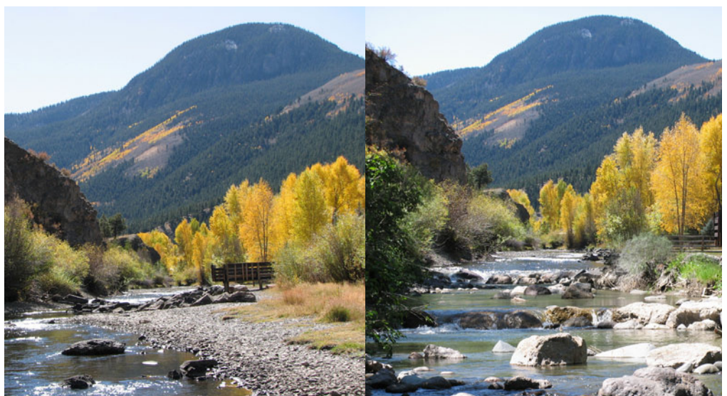
Left: Current conditions of the Lake Fork of the Gunnison River; Right: an enhanced image of proposed instream improvements.

Enhance and protect the ecological health and recreational quality of the Lake Fork of the Gunnison River and Henson Creek to improve fisheries, riparian areas, river hydrology, recreation, and river access in the Lake City region.