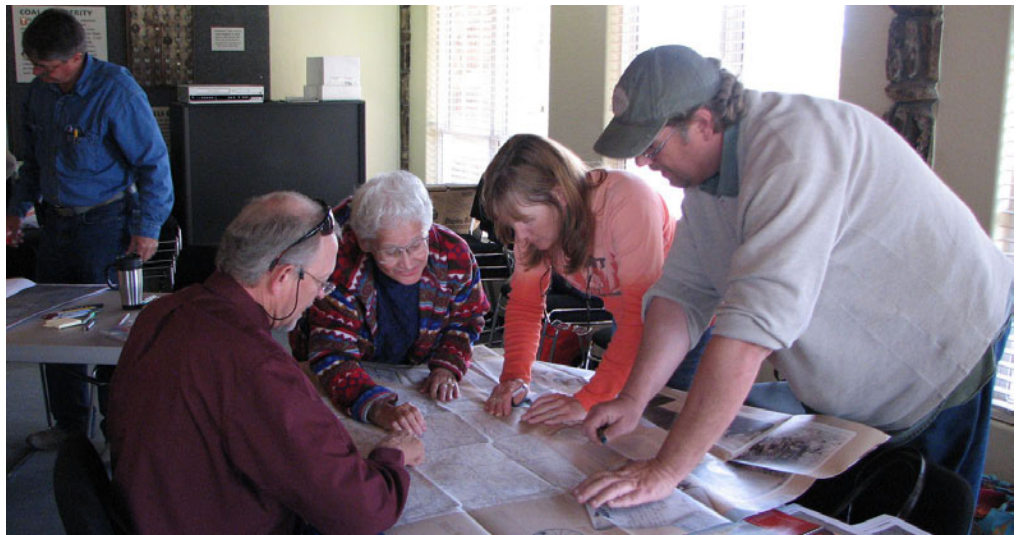
Huerfano County community members and partners at a trail alignment workshop at Lathrop State Park.