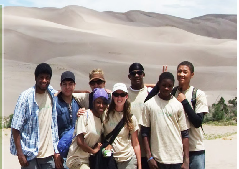
Groundwork Denver Green Team at Great Sand Dunes National Park & Preserve during the 2010 Summer of Service

The Rivers, Trails, and Conservation Assistance (RTCA) Program is the community assistance arm of the National Park Service. RTCA staff provides technical assistance to community groups and local, state, and federal government agencies working to protect natural areas and water resources and enhance close-to-home outdoor recreation opportunities. We help communities plan, organize partnerships, and achieve on-the-ground success on projects they initiate.