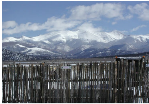
The Sangre de Cristo Mountains, a cultural landscape in the Sangre de Cristo National Heritage Area and scenic icon for Costilla County Trails.

Develop the first master plan for trails, recreation, and open space in Costilla County that identifies community resources, needs, and priorities for recreation and conservation projects.