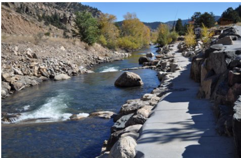
The Clear Creek Greenway

The County has leveraged funds from numerous sources to help finance these accomplishments. More than $1.3 million has been raised from Great Outdoors Colorado (GOCO), the Colorado Department of Transportation, the American Recovery and Reinvestment Act (ARRA), and other sources to supplement the work and money that Clear Creek County contributed.