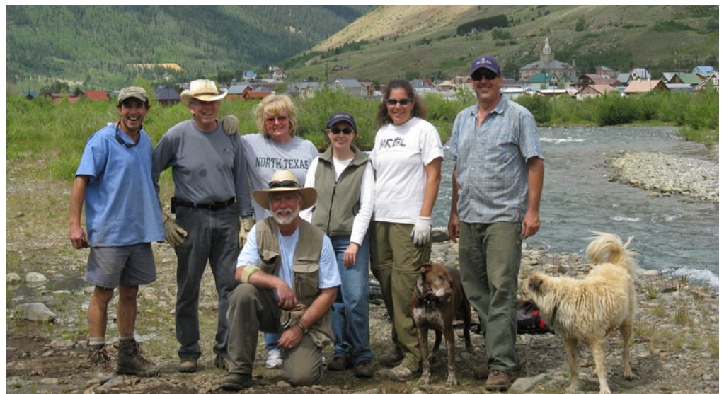
Volunteer crew after a long day of improving trails in Silverton.

Train local residents in trail construction and maintenance. Plan and design a trail across a wetlands area that will provide a better experience for the users while protecting the sensitive landscape.