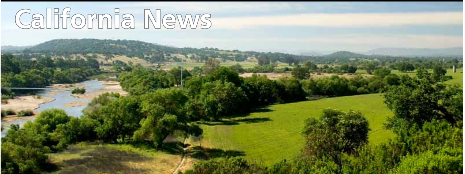
The Salinas River near Paso Robles, California.