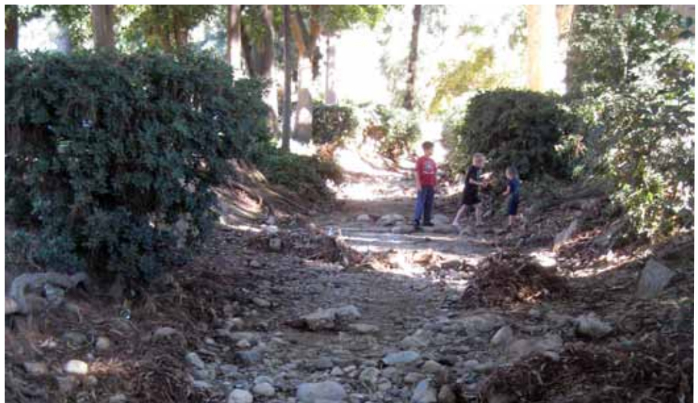
Children playing in the historic Zanja irrigation channel in Sylvan Park, Redlands.

This project will result in the creation of a six-mile greenway that follows and protects the alignment of the historic irrigation ditch, "Mill Creek Zanja", located within the City of Redlands in San Bernardino County. The Mill Creek Zanja, constructed by Serrano Indians in 1819, is listed in the National Register of Historic Places.