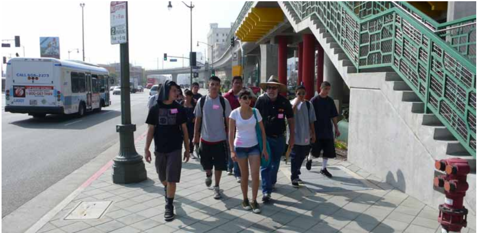
High school students from the Arroyo Seco Academy participating in a walkability assessment of urban trails in the Cornfield Arroyo Specific Plan area near downtown Los Angeles.