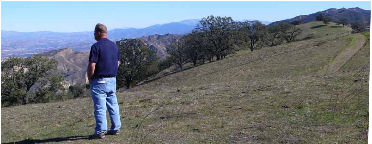
Crest to Coast Trail partners conducted field surveys of proposed trail routes in the Santa Clarita area. The trail will eventually link the City of Santa Clarita to the Pacific Crest National Scenic Trail and the California Coastal Trail.

Building on an earlier plan for the Lower Tuolumne River Parkway, this boating trail will extend along a 52 mile segment of the river near the City of Modesto, approximately 75 miles