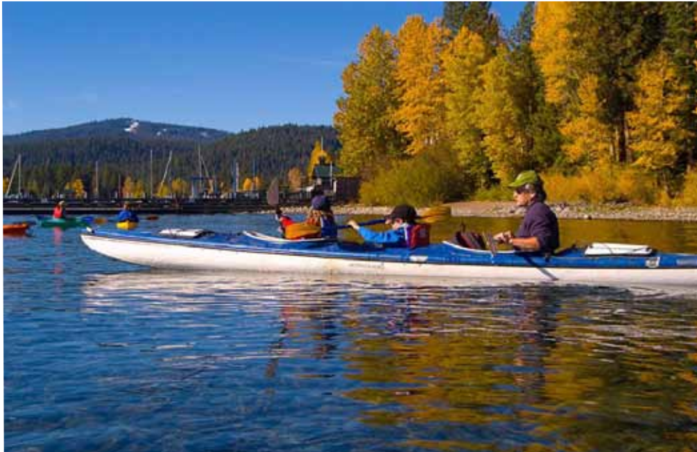
Paddling in the fall on Lake Tahoe.

southeast of Sacramento in California's Central Valley. The project will result in a quiet-water boating trail with improved public access that runs from below La Grange Dam to the confluence with the San Joaquin River.