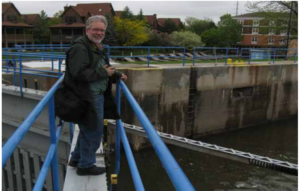
Fox-Wisconsin Heritage Parkway Water Trail - DePere Lock

Assist the Grantsburg Area Chamber of Commerce in the planning, design, and implementation of an Interconnected trail system in Grantsburg, Wisconsin.