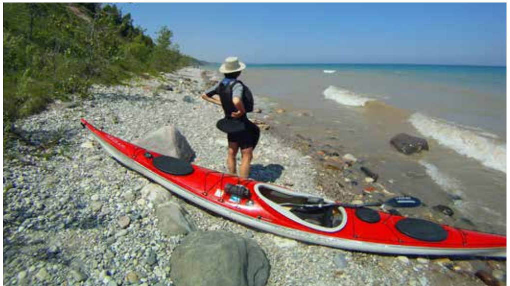
Wisconsin's Lake Michigan Water Trail - Beach Access.

Work with a team of designers, interpreters, land managers, historians, and a sculptural art student to develop artistic interpretive panels. Assist in developing a user friendly map, brochure, and website; help complete a National Water Trail System application.