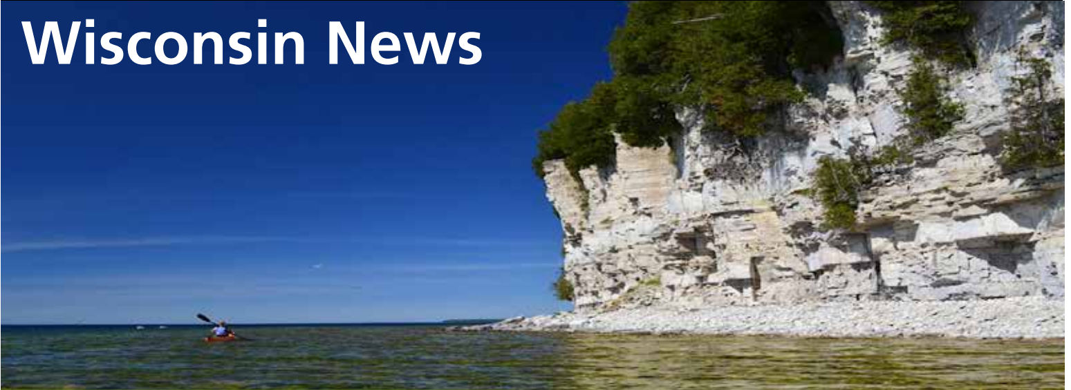
The sheer cliffs of Inspiration Point, Rock Island can be traced from Door County to Niagara Falls.