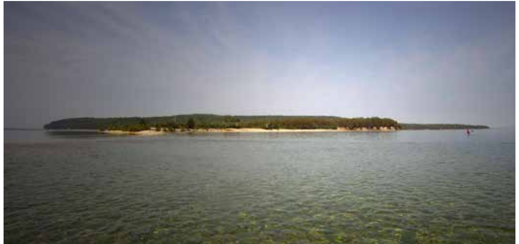
Island off the tip of Door County peninsula and part of the Lake Michigan Water Trail.

The NPS assisted with defining goals and objectives for the greenway plan; developing public involvement; facilitating regional workshops; and formulating the plan's structure and content.