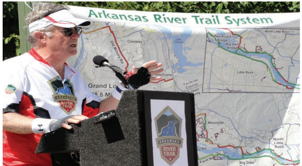
Signing of the Memorandum of Understanding that establishes the Arkansas River Trail System.

Work with the city to develop a trail plan and to help find funding for trail development.