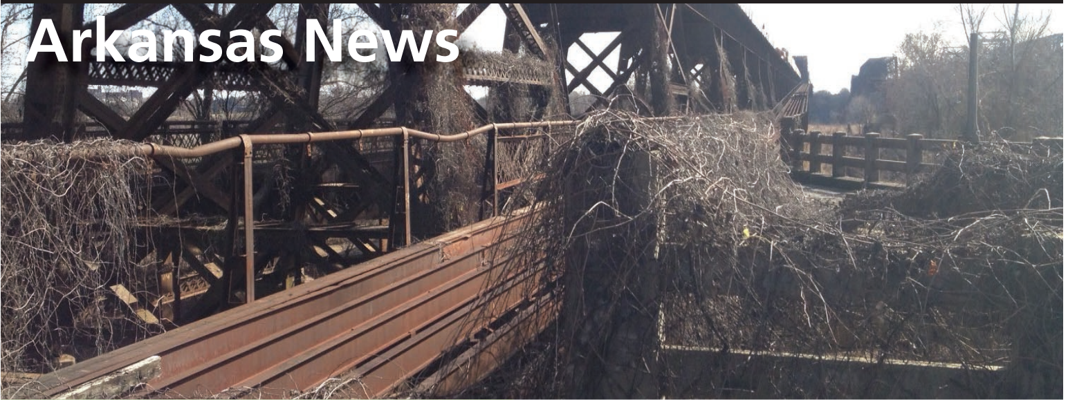
Harahan Bridge a pedestrian bridge in the making, West Memphis Trails Planning.