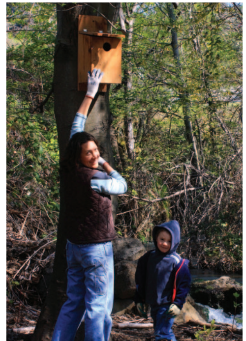
Jewett Creek Watershed gets new bird boxes and appreciation from the next generation.

Underwood Conservation District (UCD) and Jewett Streamkeepers have a vision to create a community greenway within the Jewett Creek watershed in White Salmon. They want to work with partners and willing landowners to create trail access, restoration opportunities and a heightened awareness of the creek within this Columbia Gorge community. RTCA will help guide them in working with government entities,