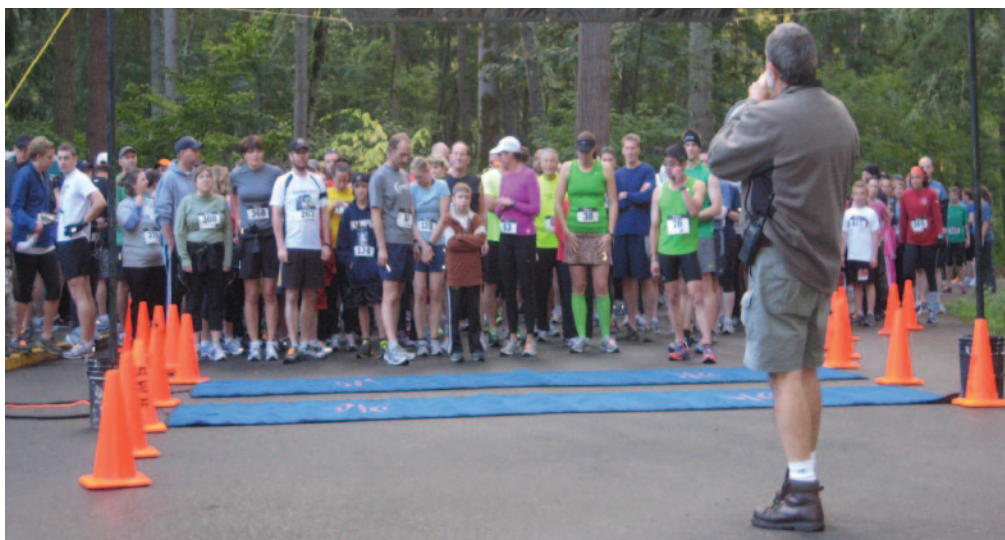
Racers get ready to start the annual "Run Wild" 5k and 8k at Northwest Trek.

This water trail will link the Lewis River to Vancouver Lake via public lands along these waterways. The project goals are to create a master plan, signage, and a map.