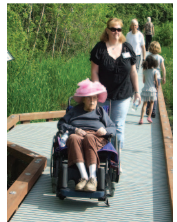
Mount Vernon’s Kiwanis Boardwalk, opened Spring 2011, is hugely popular – including with nearby residents in an assisted living facility.

When Mount Vernon began creating a “Healthy Communities” component for the city’s action plan, citizens identified trails as a top priority for community health. A diverse ad hoc trail committee was organized, and their focus quickly broadened from public access to the levees to a citywide system of “urban trails” and connectivity. Initially recruited for 12-18 months, the Urban Trails Committee has worked for more than six years to make dramatic progress on creating a connected trail system, with more than $3 million in grants and local match funding a rich variety of trails.