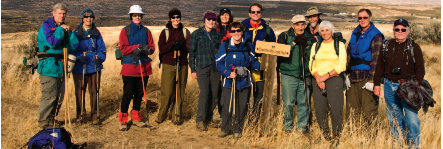
The William O. Douglas Trail runs 75 miles from the Supreme Court Justice's hometown of Yakima to Mount Rainier National Park.