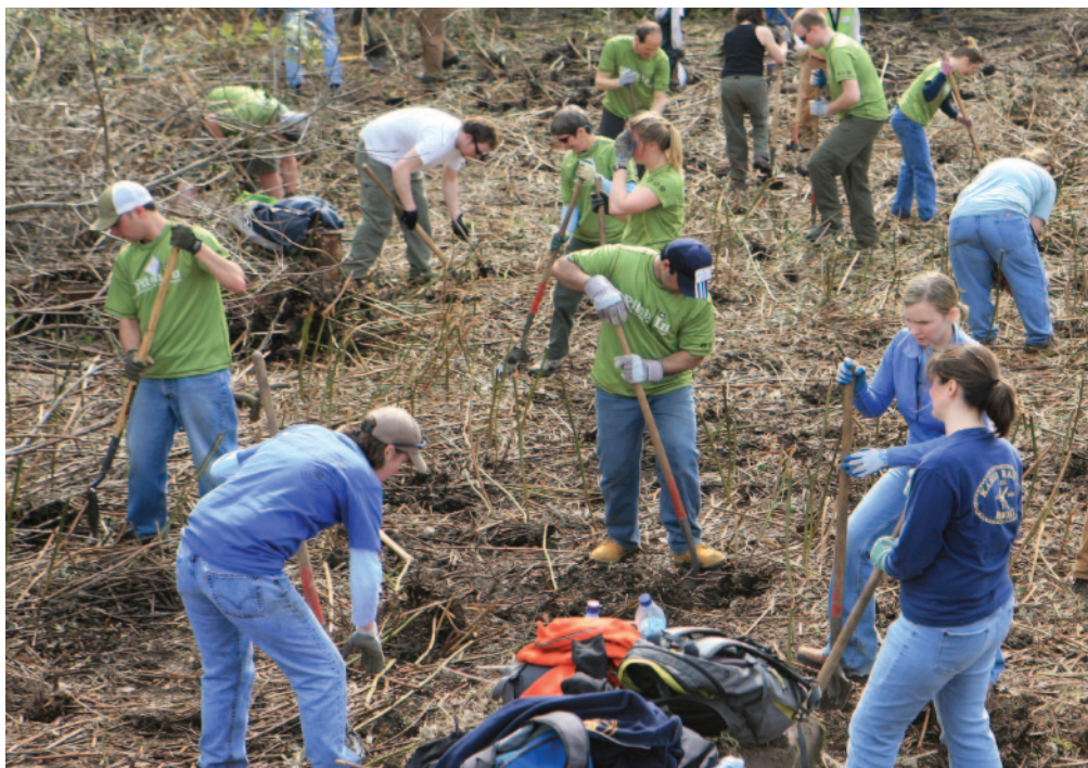
An EarthCorps "Grubbing Group" works to restore watershed health.

RTCA is serving on the ROSS steering committee working to create a preliminary conservation strategy to frame overarching issues and provide the conceptual foundation for seven central Puget Sound watershed studies. In addition, RTCA will assist in public participation and outreach during the watershed-scale studies.