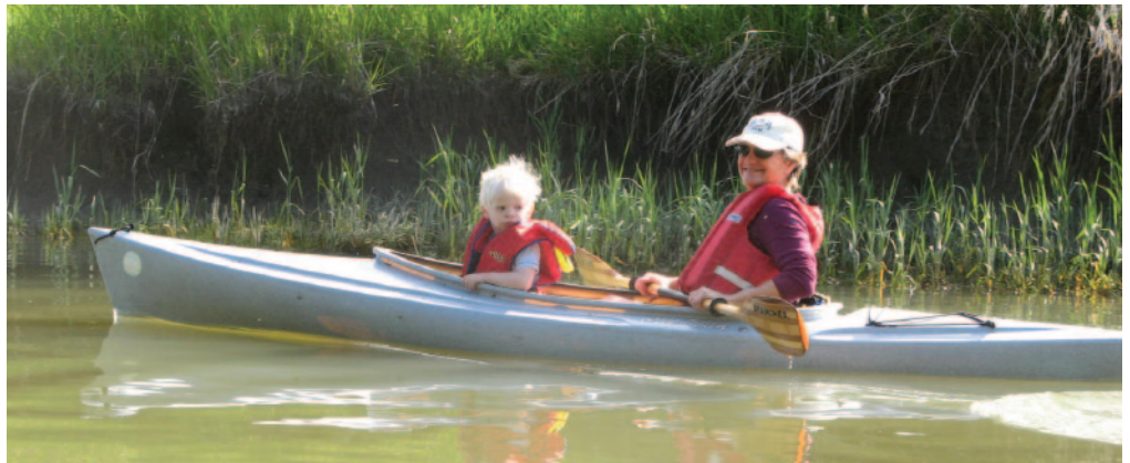
Water trails help people discover new perspectives about their waterways and their communities, while benefiting the local economy.

RTCA will help this community coalition create a potential 20-mile network of trails on Lopez Island that will connect key community destinations, including existing parks and trails, Lopez Village, and the ferry landing.