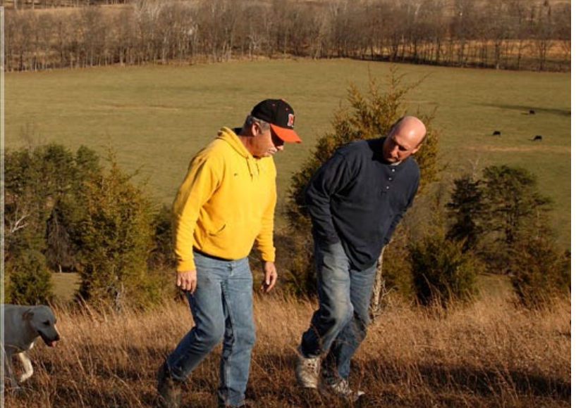
Cacapon Voices