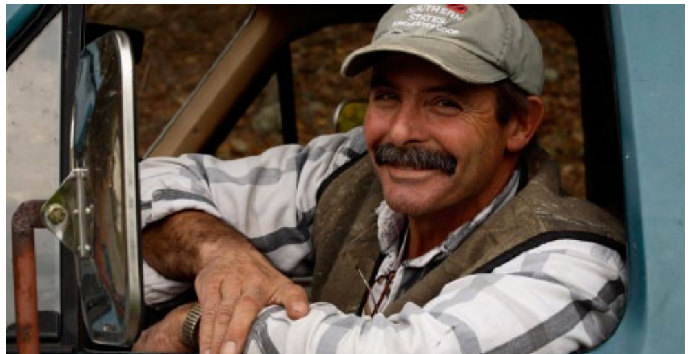
Cacapon Voices