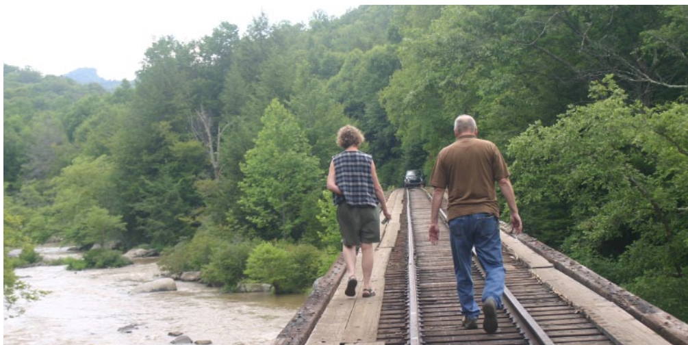
Assessing the Meadow River Rail Trail

Build a trail, garden, and wetland at Page Jackson Elementary School. Future phases will include mapping safe routes to schools and developing an action plan with possible sidewalk additions and signage. Achieve a trail county plan, prioritize projects, and continue to build community coalitions which will eventually lead to a comprehensive county network of trails.