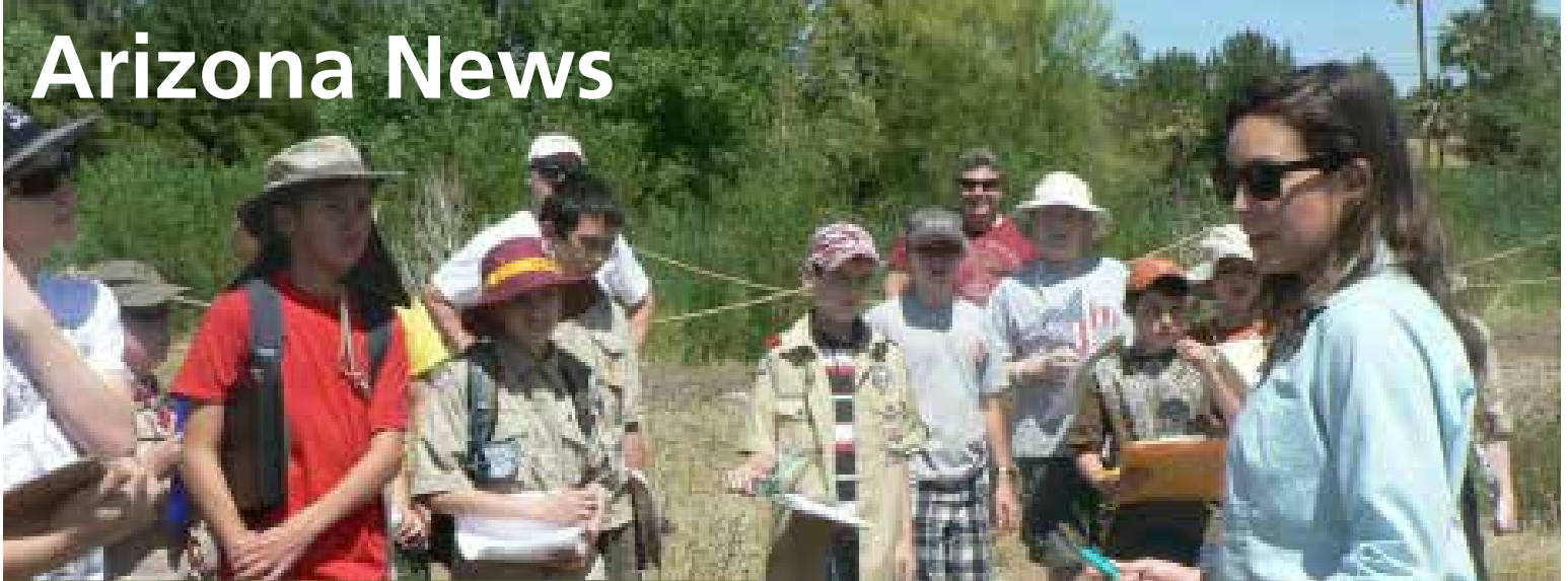
Youth learn about environmental science.