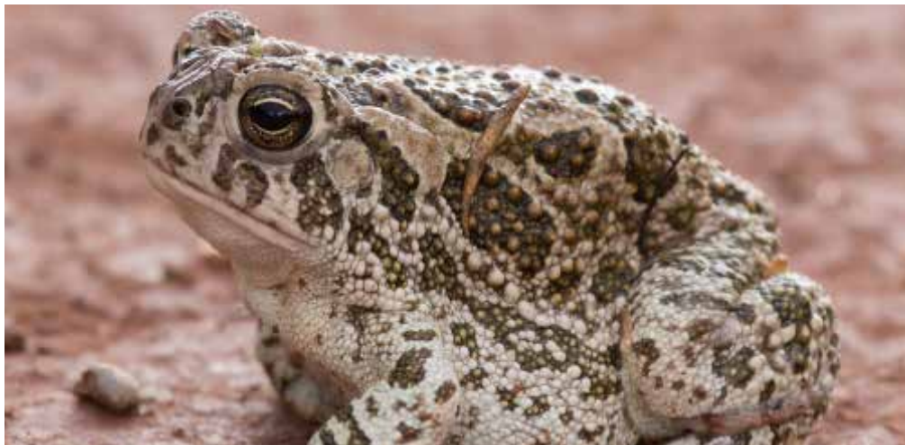
Great plains toad surfaces after monsoon rain in Hidden Cove Petroglyph and Ranch Ruins, Holbrook.

Construct 7 miles of trail, restore 50 acres of riparian habitat, create seven interpretive waysides, and plan and print 1,000 wildlife and plant field guides.