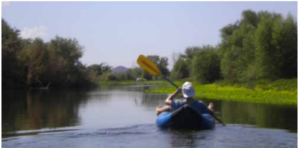
Paddling Gila River Near Avondale.

Assist project partners in preparing the National Water Trail System application and promoting public involvement.