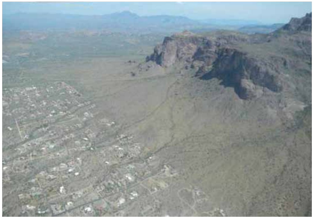
Superstition Mountains Foothills Pinal Open Space Protection project. Aerial views of land development up to the Superstition Wilderness boundary.

Help convene and facilitate a coalition of partners and stakeholders to research effective riparian and watershed protection ordinances; identify and prioritize most critical drainage, riparian corridors, and habitat areas; develop draft language and elements for watershed protection policies; and help create educational and outreach materials for the project.