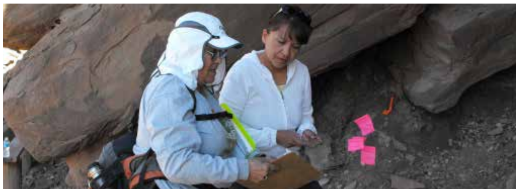
Volunteers recording rockart at Hidden Cove Petroglyph and Ranch Ruins, Holbrook, Arizona.

This monumental effort by volunteers and the local community will help park managers better understand the current extent and condition of Hidden Cove Park's rockart and guide decision-making regarding future park operations and management.