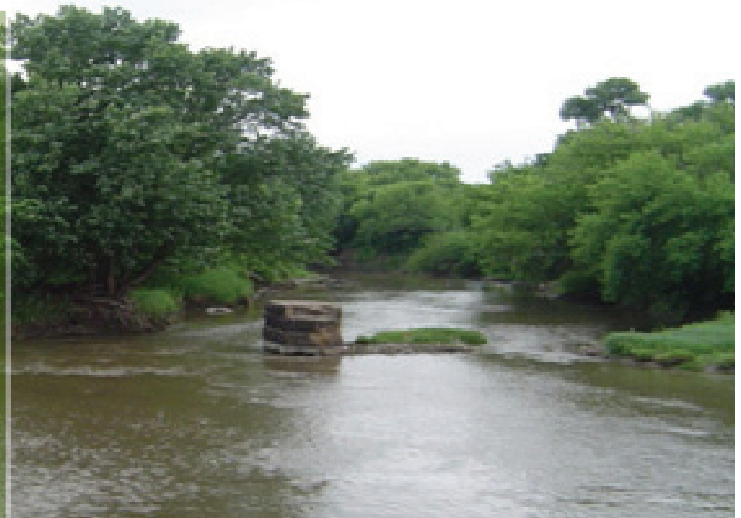
Vermillion River - the site of Centerville's history and future recreation.