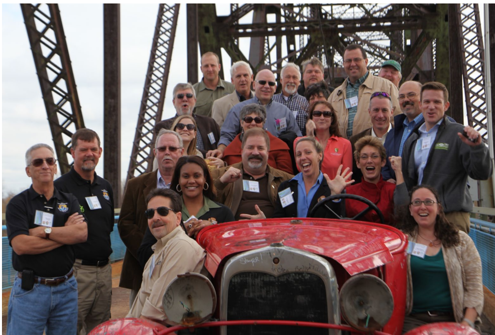
MRCC members "Take a Ride" on the old Chain of Rocks Bridge in St. Louis.

To assist the Mississippi River Connections Collaborative with organizational development, outreach to other organizations, and agencies and development and implementation of their strategic and operations plans. Increase MRT's capacity to help develop water and land-based trail along the Mississippi River.