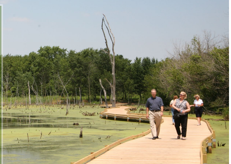
Dedication Event at Crete Nature Park