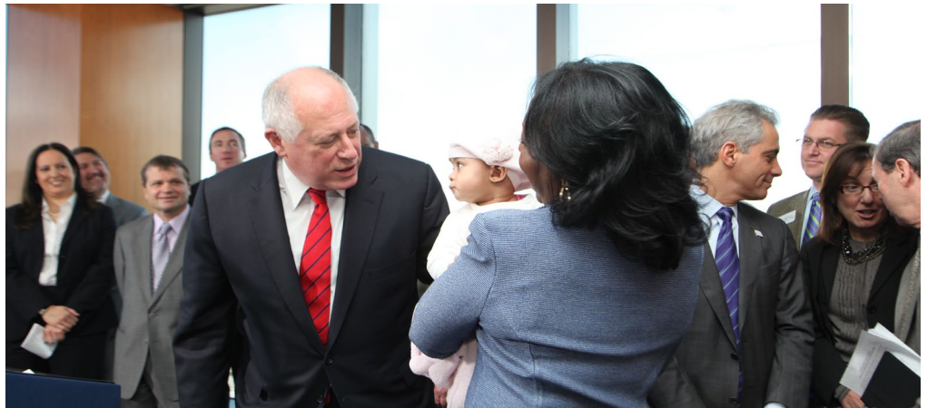
Governor Quinn talks with his youngest supporter at the announcement of the Millennium Reserve.

Convene quad state paddler organizations, local governments, and state governments to set a vision, mission, and goals/outcomes leading to the designation of the 200-mile Lake Michigan Water Trail as a National Recreational Trail.