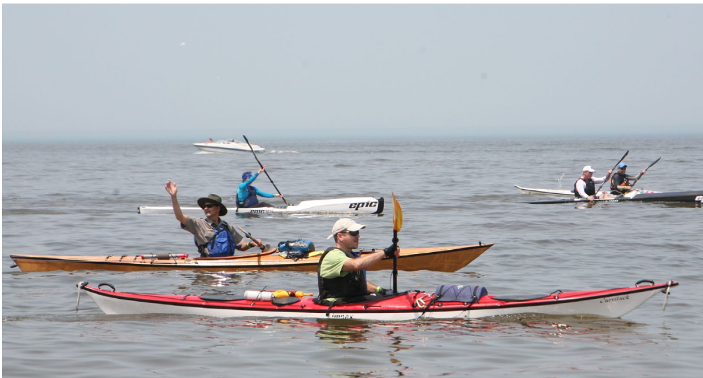
Lake Michigan Paddlers on their way to the National Trail Designation Event.